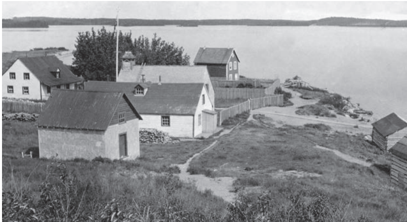
Osnaburgh House.