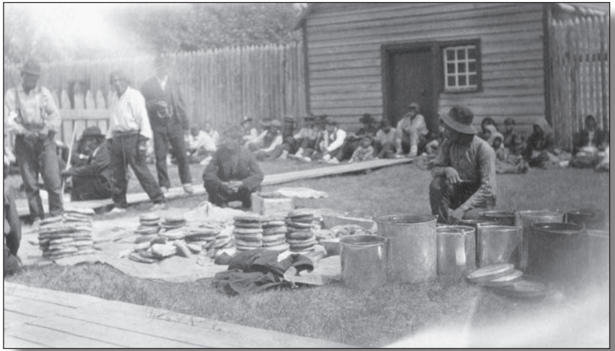
Feasts were held after every signing ceremony. Company posts made a small profit as a result. An additional fifty tons of flour was sent to HBC posts to satisfy Aboriginal demands following the distribution of treaty money, and to provide for the feasts.