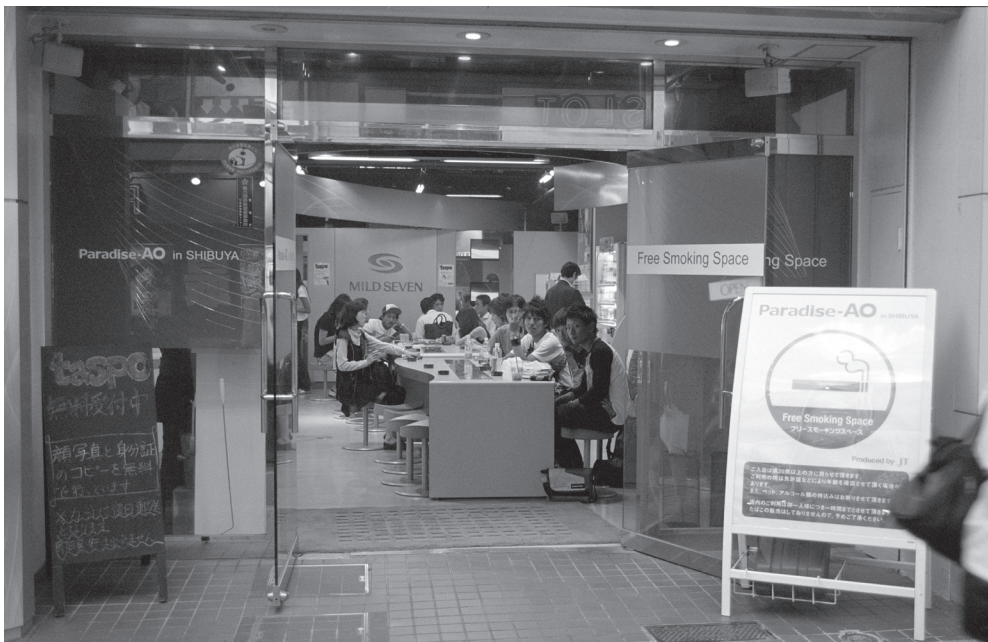
Paradise-AO in Shibuya, 2009

Going on a trip? Whether taking a train across Canada or flying to your favourite destination, you no longer have to worry about the long trips with patches or the white knuckling cold turkey approach.