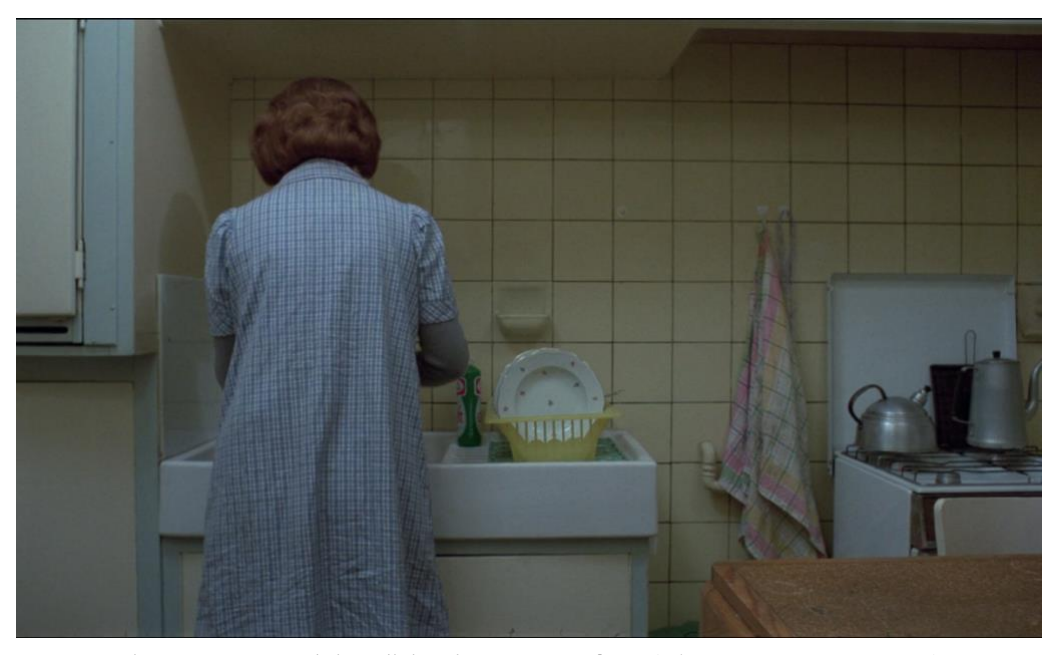
Figure 2. Jeanne doing dishes in Jeanne Dielman (Akerman 1975, 01:00:27)

experience of repetitions.<sup>5</sup> In a sequence from Jeanne Dielman , after the son departs for school, Jeanne starts to clean the apartment. At one point, a long take shows her doing the dishes. Akerman places the camera behind Jeanne, so that the audience sees only her back and arms. Throughout this long take, Jeanne never turns to the camera; her manual activities are shown through the movements of her anonymous body onscreen (Figure 2). In doing so, the film provides the audiences with neither images of her facial expressions, nor images of her hands at work. With this limited visual knowledge, the audience cannot predict the end of this chore and with it, presumably, the end of the shot, as the pressure of waiting builds. The audience's eyes and attention thus frequently drift within the cinematic frame, and they spend their time with Jeanne doing the dishes.