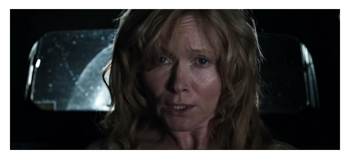
Figure 3. The opening Shot of The Babadook (Kent 2014, 0:01:07)

but fails immediately after some small glass fragments fall into the frame. A series of narrative questions may linger in the audience's mind without any absolute answer given at this moment: Who is she? Where is she? Why is she there? The lack of clear answers isolates viewers from the character in the film and allows them to recognize their experience of time in the theater.