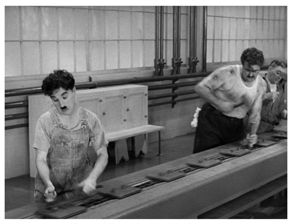
Masculine repetition. Modern Times (Chaplin 1936, 0:14:52)

intervals (Figure 1). However, women's time has no obvious relation to progress and production. Kristeva describes women's time as cyclical and non-progressive. Women's time suspends rather than animates duration. I find this distinction useful to break down the concept of repetition of work. It is not that repetition is only assigned to a single gender. Rather, there are two types of repetition: one is visible and valued, even if it is shown to be alienating (as in Figure 1 below), while the other is invisible and devalued. The latter is what I call feminine repetition , since it seems never to produce the kind of progressive temporality that characterizes masculine time. To be clear, I do not intend to use the word 'feminine' to perpetuate a binary understanding of gender. Since I connect the temporal repetition to the notions of production and reproduction, which have been assigned along gender lines, the notion of feminine repetition aims to acknowledge this culturally gendered division in terms of (re)production, rather than perpetuating the biological binary.