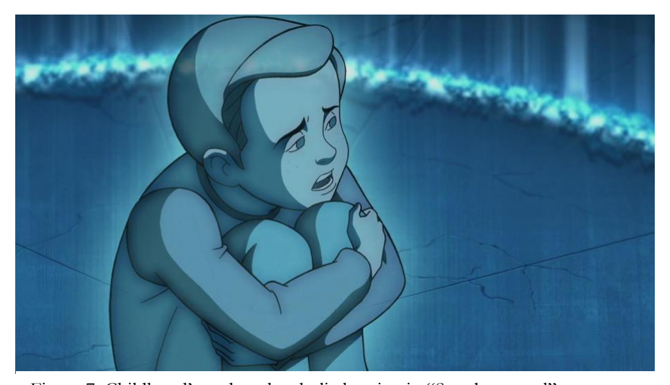
Figure 7: Childhood's end: melancholic longing in "Scoobynatural"

In a moment of poignancy that also ironically recalls the many unmaskings of flawed human evildoers in Scooby-Doo , the violent ghost in "Scoobynatural" turns out to be that of a dead child who seeks his father (a significant factor of Sam and Dean's own quest). The boy's soul is tied to a pocket knife, that iconic adventure "tool" of clichéd boyhood. (It will later be seared to char by a blow-torch.) Thus, the crossover of the mystery from the outside world of Supernatural to cartoon-world and back suggests a kind of shared loss as well. The scene of the child mourning the inability to cross into the spirit world to join his father is another in the episode's compelling images of melancholic longing (Figure 7).