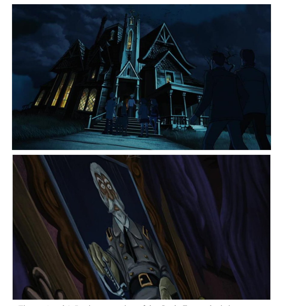
Figures 1 and 2: Loving recreation of the Scooby-Doo aesthetic in

Even though in the narrative of "Scoobynatural" the opportunity comes as the result of a curse, Dean's desire to insert himself into the sacrosanct world of Scooby-Doo —to defend it, and protect it—is dreamy to the point of desperation. This kind of nostalgia in "Scoobynatural" also manifests aesthetically, in the animation's painstaking recreation of the Scooby -verse. The cartoon haunted house backgrounds are stunning recreations, and some of them look almost like visual grabs of the animation plates from the original Scooby-Doo episode (see Figures 1 and 2).