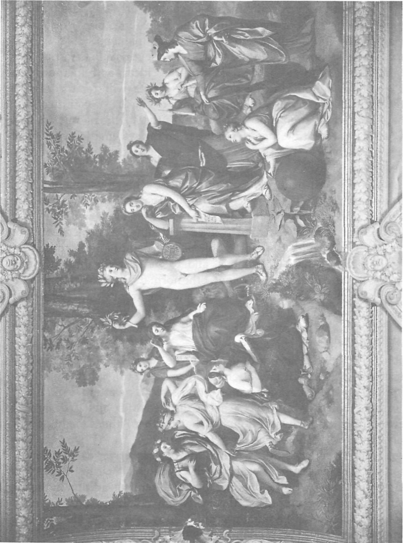
The Parnassus Fresco of Apollo, Mnemosyne, and the Nine Muses; Villa Albani (now Torlonia), Rome

Mengs slips into this position more by way of practical, pedagogical concerns than of carefully argued, philosophical reasons (1:40, 78), the problematic import for theory of art is still serious: canonic art becomes essentially a kind of palimpsest.