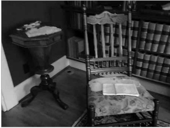
FIG. 6. ROCKING CHAIR AND SEWING TABLE IN NED'S STUDY. | ADAM KIRKEY, 2014.