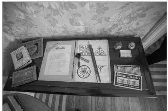
FIG. 9. A SELECTION OF DOROTHY WYATT'S ART SUPPLIES ON DISPLAY IN HER BEDROOM.

used to contest previously held assumptions about separate sphere ideologies.