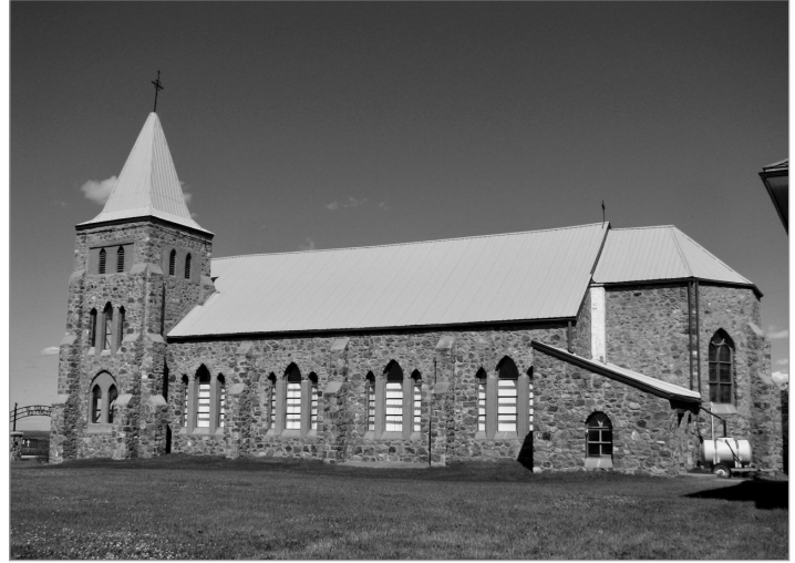
FIG. 6. VIEW OF THE SOUTH SIDE OF KAPOSVAR ROMAN CATHOLIC CHURCH, KAPOSVAR, RM 183, SK (1906-1907). UNKNOWN ARCHITECT, PIROT STONEMASONS.

narrative held within the façade showed unlimited ambition for the future of the congregation and the colony, one on par with the highest glories of their homeland.