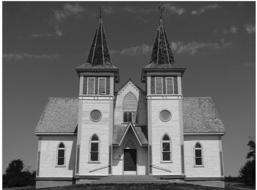
FIG. 10. VIEW OF THE WEST FAÇADE OF BEKEVAR PRESBYTERIAN CHURCH, BEKEVAR, RM 94, SK (1912). UNKNOWN ARCHITECT. | KRISTIE DUBÉ.

somewhat temporary. 24 It is therefore unusual to have overly large wooden churches in Saskatchewan, though there are some notable exceptions, such as Holy Trinity Anglican Church at Stanley Mission (1854-1860, fig. 8). However, Bekevar's committee was looking to compete with Kaposvar, and so needed to create something that was similarly arresting. They chose to accomplish this feat by adopting the features of a great medieval church.