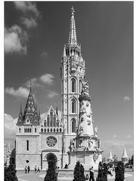
FIG. 4. VIEW OF THE WEST FAÇADE OF MATTHIAS CORONATION CHURCH, BUDAPEST, HUNGARY (14 TH CENTURY). | STEFAN SCHÄFER, LIC.

Evidence of the congregation’s involvement in the construction of the church is found in the particulars of the design of the façade, where links to the great churches of their native homeland are evident. The most likely source of inspiration was the great coronation Church of Our Lady (Matthias) in Budapest (fourteenth century, fig. 4). The general massing of the façade, with the northern tower being substantially lower than the southern one is quite similar, albeit simpler in design (figs. 1 and 4). It was common for churches to begin construction with the