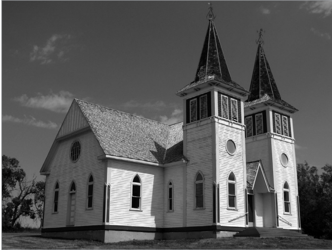
FIG. 2. VIEW OF THE WEST FAÇADE OF BEKEVAR PRESBYTERIAN CHURCH, BEKEVAR, RM 94, SK (1912). UNKNOWN ARCHITECT. | KRISTIE DUBÉ.

of late nineteenth- and early twentieth-century Canadian religious architecture, favouring a denominational theme results in a focus on the motivations of the French- or English-speaking clergy. While useful in understanding the larger movements of complex religious organizations during a dynamic period, this approach can also result in the perpetuation of an Anglo/French-normative perspective, at the expense of the minority immigrant narratives of the congregations. This consequence is particularly possible with Saskatchewan's early built heritage due to the often disparate motivations of the English/French clergy and the ethnic minority congregations. Consequently, I propose an alternative perspective, one that uses a micro-history approach, in order to rediscover these minority immigrant stories. In the interest of demonstrating the extent of the immigrant narratives that can be uncovered, I will here re-examine two structures that I have already explored in the traditional denominational/architect-driven approach, Kaposvar Roman Catholic Church ([Rural Municipality] RM 183, 1906-1907, fig. 1) and Bekevar Presbyterian/Reformed Church (RM 94,