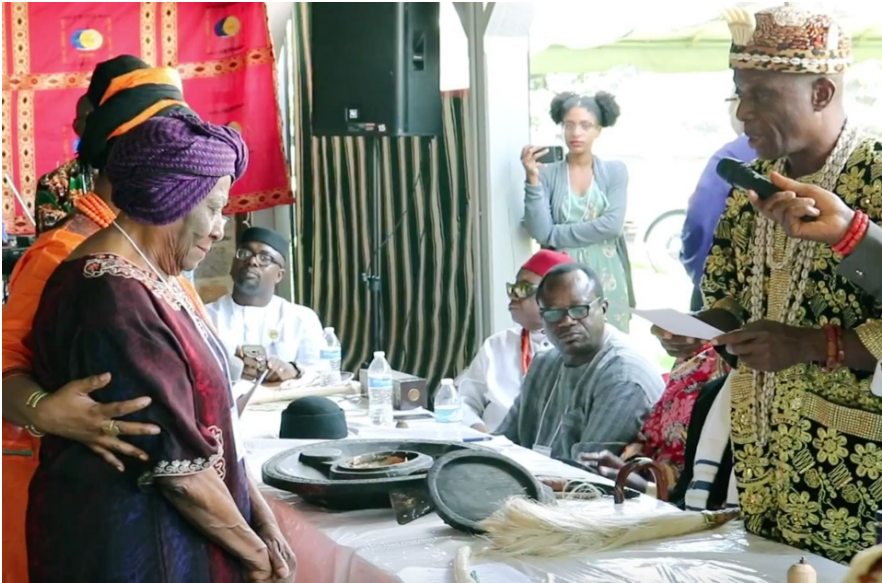
Figure 2. 2018 Ìgbò Reconnection Ceremony in Staunton, VA.

different in the twenty-first century than in the 1950s and 1960s when Pan-Africanism (Black solidarity) was so essential for African independence and civil rights movements. Identity formation around ethnic heritage for African Americans has been transformed through DNA testing. An example of this move to ethnic recognition is the annual Ìgbò Reconnection Ceremonies in Staunton, Virginia, and Chicago, in which DNA-tested African Americans are re-initiated into the Ìgbò ethnic group through a naming ceremony. The event is focused on people of Ìgbò descent and prioritizes their reconnection, but also welcomes people not of Ìgbò descent, and the 2018 ceremony welcomed a young white male to the Ìgbò community. Thus, even white people who want to associate with Africa are being more ethnically specific instead of pan-African. Focusing on understanding and appreciating a single ethnic group avoids essentialism.