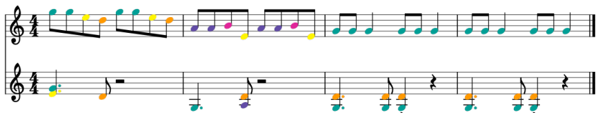
Figure 6. Ùbò-ákà (Ìgbò name for lamellaphone) duet, composed by Quintina Carter-Ènyi

A wide variety of performance activities, both ethnically specific and eclectic, may be engaged once the instrument has been tuned and, optionally, a pickup installed. Figure 6 is an example of a duet that Quintina composed for students based on Ìgbò melodic and rhythmic motives. This has been used consistently with general education students, many with no prior musical training.