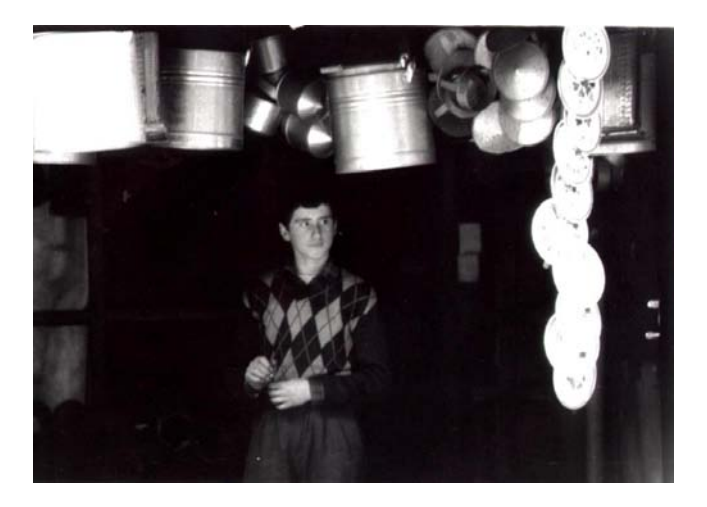
Fig. 3. Still from Look at me (1998) by Petek Berksoy.