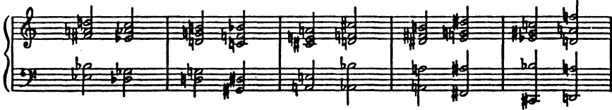
Figure 1. : From “Problems of Harmony” in Style and Idea (1975), pp. 229-230

Finally, in a most revealing speculation, Schoenberg claims that the integrity of motivic design and function is, at least for him personally, of greater interest than the consistent and “grammatical” organization of the harmonic texture (See 1975: 279). Although he admits the central role of harmonic consistency and function in the perception of a tonality, he attaches a higher value to motivic development in the “intelligibility” and significance of a work. Moreover, Schoenberg believes that the tonal implications of complex harmonic materials which defy simplistic triadic organization (i.e. 5- or more-note chords as typically found in his serially music in his example 6 above) have yet to be fully defined. They could therefore be explored compositionally for the