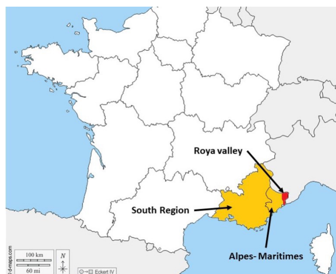
Figure 1. Localisation of the case study.

On the second and third of October 2020, storm Alex hit the Roya, the Vésubie and the Tinée valleys in the Alpes-Maritimes (South of France). The violence of the event – with exceptional rainfall, heavy flash floods and associated landslides – caused 18 casualties (ten deaths and eight missing persons) and around one billion euros of damages 3 , with 420 habitations and around 60 bridges and tunnels impacted, 100 km of road and 200 km of destroyed networks.