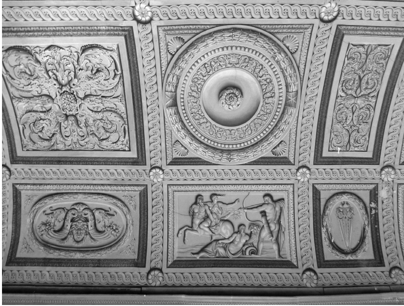
FIGURE 9 A ceiling in the Château de Tanlay, France, an example of trompe-l'oeil . 19

19. Photo by Ji-Elle [CC BY-SA 3.0 ( https://creativecommons.org/licenses/by-sa/3.0/ )], from Wikimedia Commons (accessed May 1, 2018).