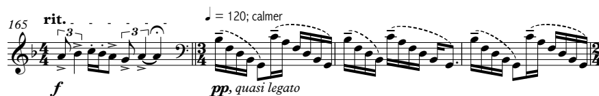
FIGURE 3 Scott Godin, Guided By Voices , mm. 165–172.

strings are closer together with five of them, I cannot simply push into the string to sharpen the clarity because I have a greater risk of hitting the other strings, especially since the string tension is lower than on the modern cello. Therefore, I tried to apply bow pressure closer to the bridge for the passage and I asked Scott if I could slur the notes because I found this combination best produced the legato and the clarity I was searching for. I also learned through this first new piece for five-string cello to accept and even enjoy a certain graininess and colour of the string sound that I don't usually have with modern cello.