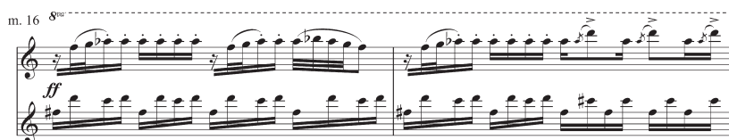
FIGURE 11 Géométrie sentimentale , iii, mm. 16-17 (piano).

Carré ’s formal organization is also related to that of the kolo : both consist of a succession of transitions between recurring musical sections. Sokolović’s heterogeneous chain of musical personalities might suggest a chain of diverse characters dancing the round dance in a circle formation. Musical objects are again presented from various perspectives. For instance, each time the orange/red robot recurs it is varied in some way: the composer applies persistent polyrhythms, upward and downward machinistic trajectories and slurred bravado scales. This robot’s music, like the kolo , is almost trance-like in its rhythmic regularity, and often uses chromatic pitch content characteristic of Serbian vocal music. The recurring piano melody first heard in measure 16 is an offshoot of this robot’s music, and goes even further in suggesting folk music with its arabesque figures and syncopated rhythms (see Figure 11).