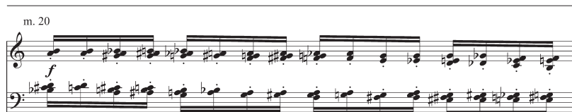
FIGURE 9 Géométrie sentimentale , iii, m. 20 (flute, oboe, clarinet, bassoon, horn, trumpet, trombone).

Finally, the green/yellow robot comes to life in measure 38. It features a rhythmic oscillation between the winds and strings—inspired, again, by the obsessive oscillations of the yellow robot—with chords that gradually become shorter in duration; this quasi- accelerando relates to the green robot's ritardando in Triangle (see Figure 10).