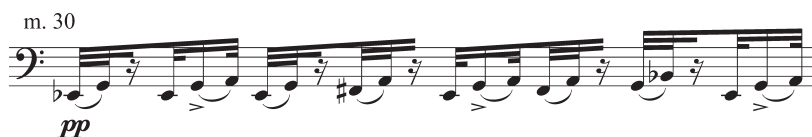
FIGURE 7 Géométrie sentimentale , ii, m. 30 (violoncello).

At its reappearance in measure 42, the orange robot wears a new harmonic mask: the chromatic cluster mask. This robot retains its transitional function, nervous sense of steady forward motion and sparkling quality—this time in the flute, oboe and clarinet—but is now comprised of pitches forming a slowly moving cluster. Bernstein has pointed out the influence of Serbian folk music on Sokolović's use of dissonant major and minor seconds in her vocal music. 20 This influence extends to Géométrie sentimentale , with the