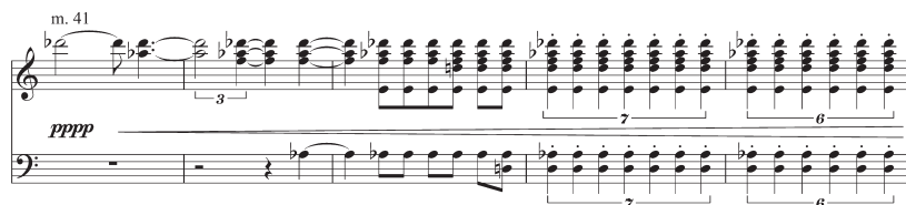
FIGURE 3 Géométrie sentimentale , i, mm. 41-45 (flute, oboe, clarinet, bassoon, horn, trumpet, trombone).

The green robot appears less frequently, and acts as a kind of “jester” robot since it distracts from the main stage action. It descends from above onto the stage in measures 41 to 43, in the wind instruments, and gradually runs out of battery power as it exits the stage (the repeated chords in measures 44 to 46 feature a written out ritardando ). This slowing gesture defines the green robot (see Figure 3).