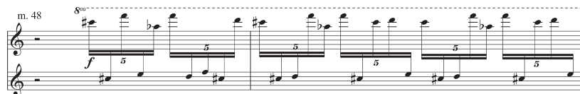
FIGURE 4 Géométrie sentimentale , i, mm. 48-49 (piano).

Finally, the fast, jerky and aggressive red robot arrives in measure 59 in the winds, characterized by a steady eighth-note triplet rhythm in the upper register and a slower, sometimes syncopated accompaniment in the lower instruments. Its aggression sometimes gets the best of it, causing steam to burst out of its head; this is illustrated musically by the sudden crescendi leading to accented chords (see Figure 5).