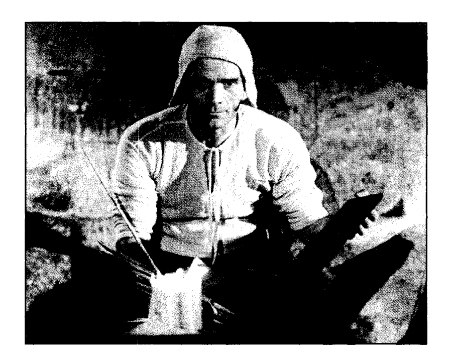
Pasolini in Les Contes de Canterbury (1971)

the coordination of the kinemes." (p. 190) Here we encounter an initial problem: the tendency to discuss the coordination of kinemes in terms of syntax, by analogy with the combination of signs in written and spoken language. "Any study of film, Pasolini writes, is vitiated by this genesis in a linguistic model." (p. 190) To understand the quality and potential of the visual monads inhabiting the screenplay, it is necessary to free film from this linguistic model. The question then becomes: "If cinema is another language, cannot this unknown language be predicated on laws that have nothing to do with the linguistic laws to which we have become accustomed?" (p. 191) The hybrid nature of the screenplay-text, and thus its subversiveness. only becomes apparent when we come to accept that any parallel between cinematographic image and linguistic sign is arbitrary, that the most we can affirm is that cinema is another language.