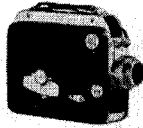
CINÉ-KODAK MAGAZINE 8

Three-second loading with interchangeable Kodachrome or Panchromatic film magazines; f/1.9 lens interchangeable with six accessory lenses, including a wide-angle lens and ranging out to a five-times telephoto; enclosed direct-view finder serves all lenses; four operating speeds including slow motion; unique footage-indicator control "doubles" as magazine release when changing film; pulsing button for gauging scene length; attached Universal Guide for all Ciné-Kodak Films.