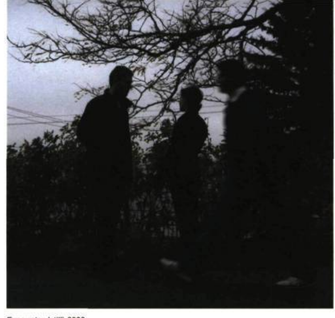
Encounter (still) 2008

I was able to view 4 finished videos works at the official opening. Footage was taken of the encounters "conducted" during the first 4 days of the exhibition. These were then edited and added each day-one per day- to a separate monitor in the space. The four final videos range between 5 and 10 minutes in length