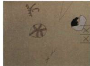
Untitled, ink, gouache, 18 in. x 24 in., February 1980