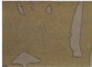
Untitled, six figures, graphite, oil, 9 in. x 12 in., 1979