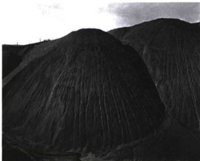
Virmy-Ridge , 1993 National Gallery of Canada Ottawa Purchased 1995 © Geoffrey James

the guise of art, is nevertheless, a human construct, no matter how lofty. It intervenes in the landscape, altering it, whether subtly or contentiously, but always irrevocably.