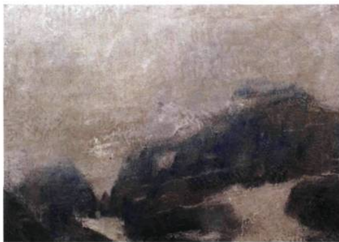
Brumes lumineuses Encaustic on panel, 23" x 32"