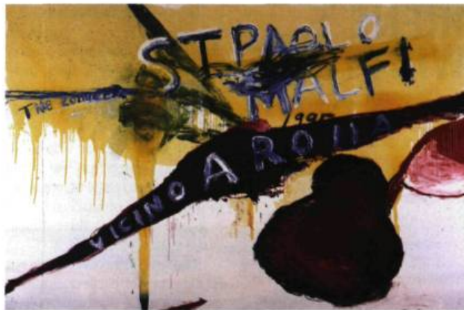
The conversion of St. Paolo de Malfi Oil, resin and gesso on canvas, 304 x 457 cm

Schnabel unlike anybody else you make this cliché statement about is someone that you actually love to hate or can't help loving. Critical reviews of his paintings have always been hotly divided. In one breath, the historical importance of his work will be cited as bringing back the rich vitality and color of painting after the rarified Minimalist