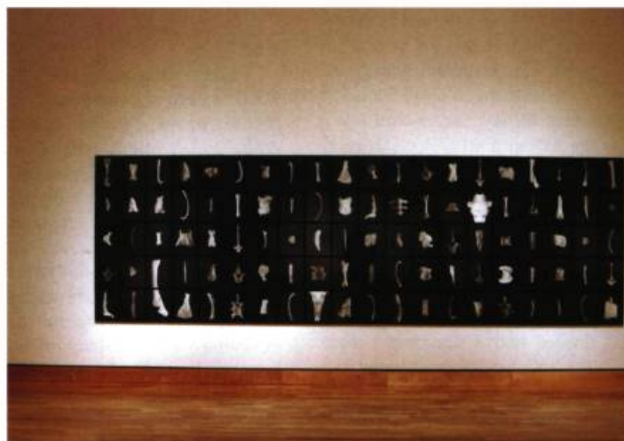
Anatomy Lesson