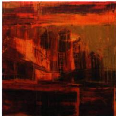
La grande ville