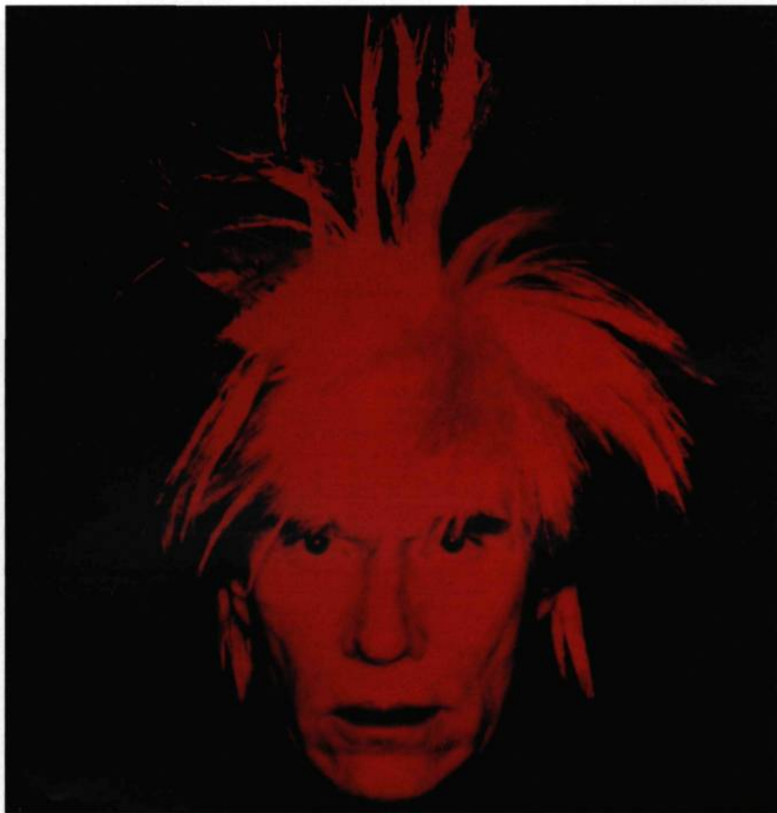
Self-portrait, 1986 Acrylic and silkscreen ink on linen Founding Collection, The Andy Warhol Museum, Pittsburgh

At least, that is how I felt before seeing Warhol: Larger than Life at the Winnipeg Art Gallery. My previous viewings had been in big-box galleries where the art was spread too thin and the irony—as in the Vancouver Art Gallery's show with attached gift shop—was spread too thick. The W.A.G.'s brutal wedge imprisons a stack of triangles subdivided into a windowless maze. The architectural heavy hand usually defeats more works of art than it serves but the Warhol exhibition manages to survive by sheer compressed will power.