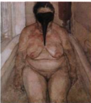
Pulcharella 2 Acrylic on canvas, 14" x 16"

First, 'Baby' pictures a newborn that sets one's teeth on edge. Rather than serenely contemplating a cherub asleep, the viewer winces at the sight of an infant screaming at the top of their lungs – as amply illustrated by their wide-open mouth, tightly shut eyes, and flared nostrils.