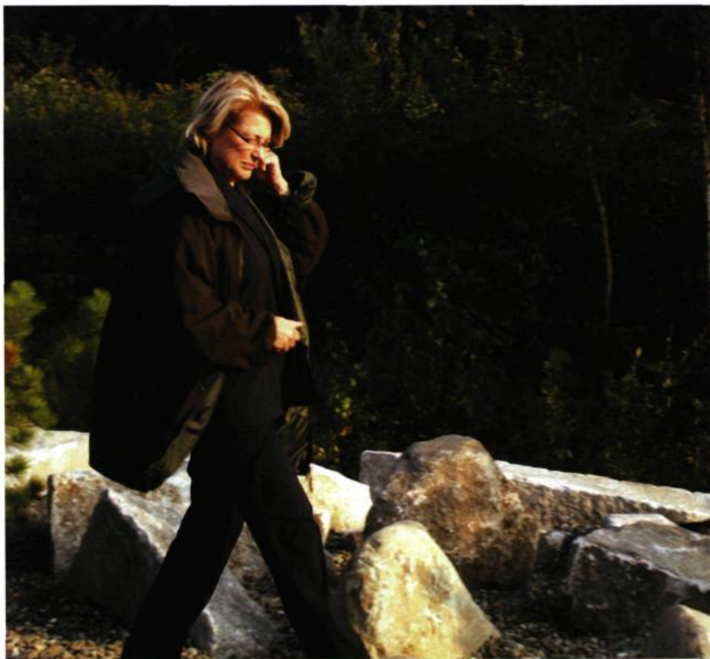
Carrière Ogden, Stanstead, 2005