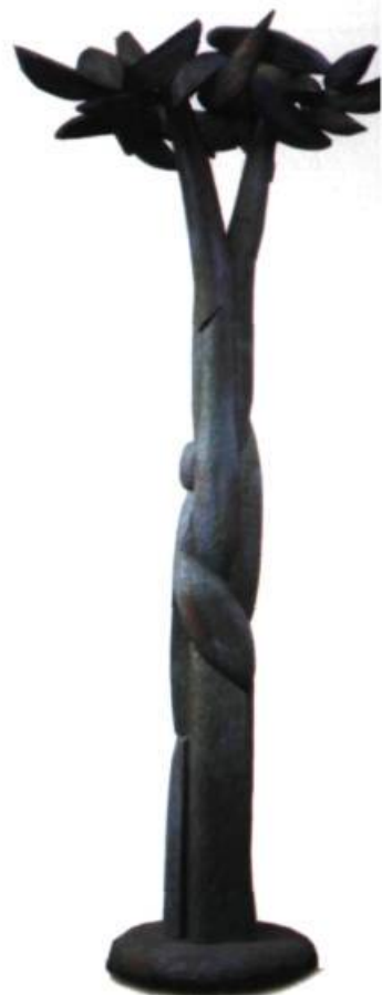
Mario Merola Tree (1992)