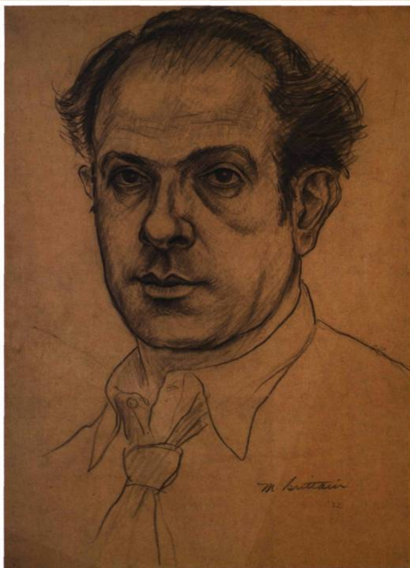
Head of a Man , 1932 Graphite on kraft paper 49.5 x 36.0 cm National Gallery of Canada (no. 28891)