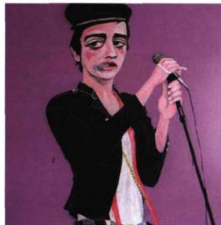
Pete Doherty, 2005

"I'm not interested in being a shocking artist and not interested in being a celebrity myself", Stella Vine is quoted as saying.