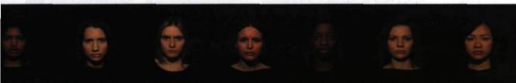
Atom Egoyan Auroras

Within this rigid spatial system, a narrative of esoteric proportions is unfolding. Each composition begins with the circle, (the only element in the painting made with the aid of a tool; the rest is all drawn and painted by hand), the sign for life's eternal cycle of birth and death.