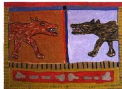
Duo-logy II (2006) Oil on canvas 18 x 24 in.

The whole Han Gallery Hugo Wuthrich show could be considered as a collective homage to an informal, essentially humanist perspective on life. Wuthrich's compositional style, catches our interest because it never takes itself too seriously, and when autobiography enters into these paintings, it is as if the artists were flirting with time, capturing moments with a mimetic abandon, as if all the world were a stage and the subjects within a paintings perpetual