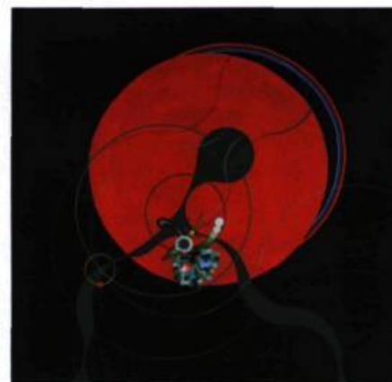
Sensualita, 48x48

The latest works by Alfredo Brusorio at Galerie Lydia Monaro are the quintessence of conceptual art. They hark to the naissance of Modernism and continue in the esoteric tradition of movimento spaziale , or spacialism, that originated in Italy in the 1940s.