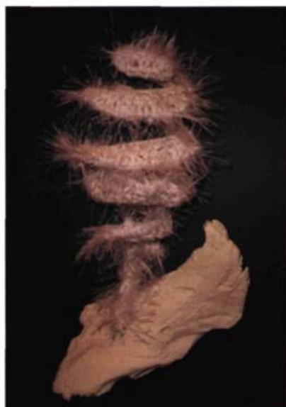
Distort # 75/100 Crocheted cotton, found object (mixing whisk), driftwood, paint 11" x 6" x 4.5"

Jeffrey Boone Gallery 140-1 East Cordova Street Vancouver, BC V6A 4H3 Tel: 604-838-6816 www.jeffreyboonegallery.com