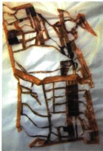
Newscuts Monday May 30th, 2005 Mixed media

October 18 – November 12 Galerie de la Ville 12001 blvd. de Salaberry Dollard des Ormeaux Tel.: 514 684-1012 xt 288 www.centreatdollar.com