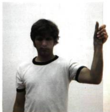
Verre 2 - 2004-2005 Digital print 182,8 x 182,8 cm

Musée d'art contemporain de Montréal Until October 9 th 185 Ste Catherine West Tel.: 514 847-6226