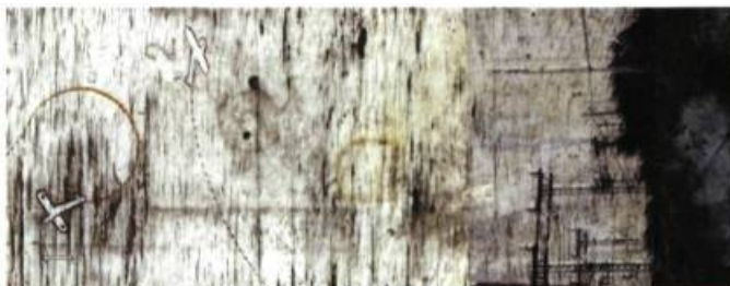
Sky Dancing Mixed media 2006

Aug. 31st – Sept. 19th, 2006 Engine Gallery 1112 Queen St. W. Tel.: 416-531-9905 www.enginegallery.ca