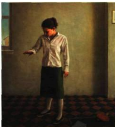
Interior with Girl and Ping Pong Table

September 28 – October 9 Galerie de Bellefeuille 1367 avenue Greene Tel.: 514 933-4406 www.galeriedebellefeuille.com