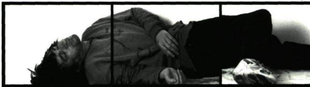
Gillian Wearing Drunk

doing this to ridicule the public venues these works are being exhibited in, or simply to see what she, and art, can get away with? Is there really any social message or goal to Wearing's work? The aesthetic seems technologically correct and if it