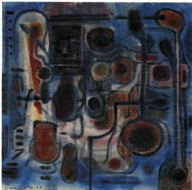
Harold Klunder Head Study #12 N.Y. Dimensions 22" x 22" Medium: Monoprint