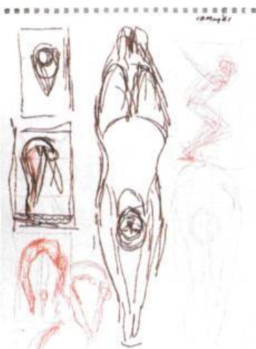
Nude and Dummy, 1950 New Brunswick Museum, Saint John