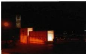
Arnaud Maggs, notification II (détail)

able images of faintly lit faces, whose fragmented histories remain shadowy and partially hidden. Boltanski's installation sustains, with an existential dexterity, the emotional charge that accompanies our memories of past time(s), incorporating the passage of time, and its inevitable collapse into remembered reality. The disparate qualities of presence and absence enable the viewer to reconstruct memories, as we do in looking at images from our own childhood. The implicit loss they signify involves a reframing of reality that is subjective and within this subjective reality, truth as the body knows it, is realized.