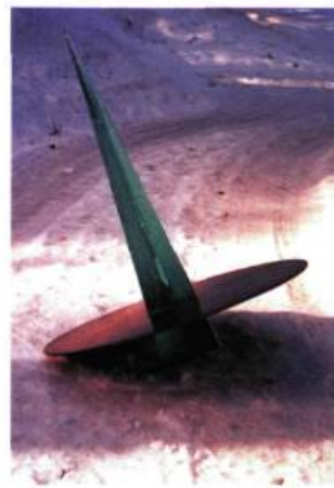
Donald Robertson Copernicus, 1993

Christine Palmiéri's multi-disciplinary work, titled Neant Compulsif 2 enacts a pushing back of the world — as — comodifier in order for her dream to maintain its distance within the context of her own personal history. Two igloo-shaped structures placed onto the floor house her past and future. Projected on these vinyl-covered structures is a pastiche of images depicting souvenirs of herself (a superimposed self-portrait), her family, and other subjects, such as fields of flowers. From above, spotlights shine down in the primary colors striking the ground as if excavating the past with pulse-like regularity. This suggests the potential for colour to open the doors to primordial realms. A recording of a gently flowing river plays on, creating a sensual convergence of light, sound, image and transcendence. The artist's intergalactic site is a simultaneous search for past and future equipped with a radical sense of experimentation. Her dream is enough to launch herself accordingly, and like Kubrick in A Space Odyssey 2001 , Palmiéri seeks the seeds of the dream by going to the depths of the symbolic traces of original thought.