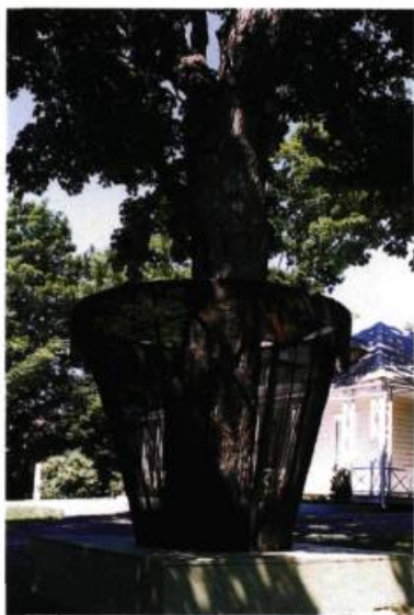
Lucie Robert, La femme en pot

historical) setting in a living natural environment is slightly unsettling. We often see such imagery along a highway, or in a city, and its purpose is usually purely commercial. Inside the museum Binet juxtaposes a section of a real tree trunk complete with insect marking on its surface with a close-up photo image of a tree. The effect is surreal. Binet's Château Richer panoramic triptych of photos of trees in a landscape after the Ice Storm are truly eloquent vista recordings of this natural catastrophe panorama.