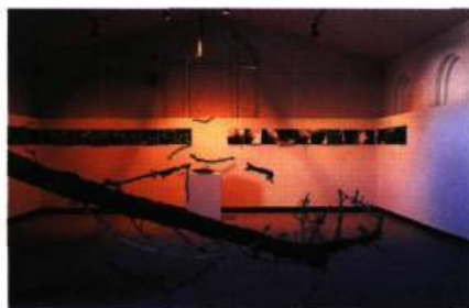
Deluge, 2000 Mixed media installation

Southern Alberta Art Gallery 601, 3rd Avenue, S. W. Lethbridge, Alberta May 6 - June 28, 2000