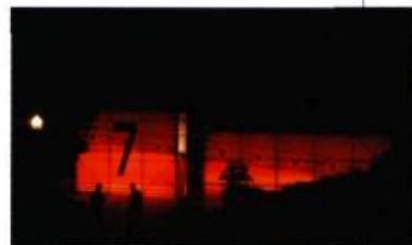
Arnaud Maggs, notification I (détail)

Art Gallery of Greater Victoria 1040, Moss Street September 15 - November 19, 2000