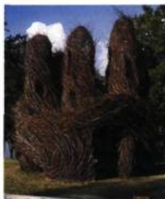
Patrick Dougherty, Yardwork Symposium Cimes et Racines Art et Nature

The two outdoor assemblages titled Le Temps Suspendu by Lynda Baril on both sides of the Saint-Maurice river are assemblages of tree-like forms that hang in the forest between trees, a hybrid fusion of the natural and man-made. Baril asked local residents in the region to provide thousands of coat hangers for