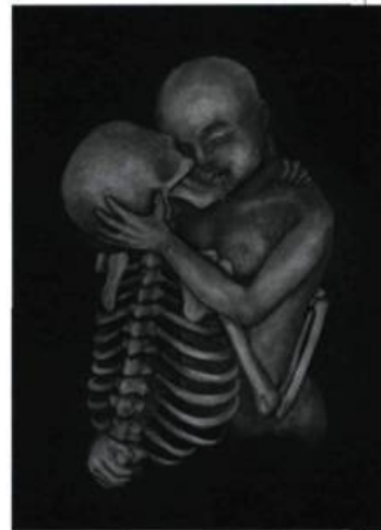
Catherine Heard Vanitas , 1999

Art Gallery of Ontario 317, Dundas Street West August 5th - October 29, 2000