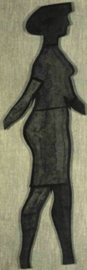
3. Michael SNOW Spring Sign , 1961. Weathered oil on plywood; 154,9cm x 49.8

Like many artists from the time of Mallarmé, Snow has always felt that art was a game. "I make up the rules of a game," he has said, "and then I attempt to play it." In choosing the Walking Woman he reacted against abstract expressionism and the works he had painted in his immediate past, which, no matter how austere and plain, were painterly. In Theory of Love (1961), for instance, Snow showed the rudiments of sex, a red bar and a red circle sans the space for the bar. In Narcissus Theme of the same year, he used similar simple geometric shapes. The Walking Woman was a way of clarifying his material and a way of developing variety, though he used the same subject. Discovering her in many different media he discovered himself. There was something hokey about her image, something raffish and casual. She wasn't intended to be more than a wry comment, especially at the beginning. But over the years, she developed. By the time he was finished with her, Snow had become a sculptor, and knew which way to go.