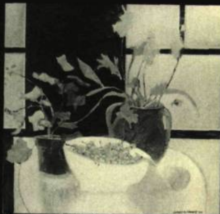
Claude-A. SIMARD Nature-morte , 1984.

2, COMPLEXE DESJARDINS, BUREAU 2600 C.P. 153, MONTRÉAL, H5B 1E8 TÉL.: (514) 281-1555 TÉLEX: 055-60917