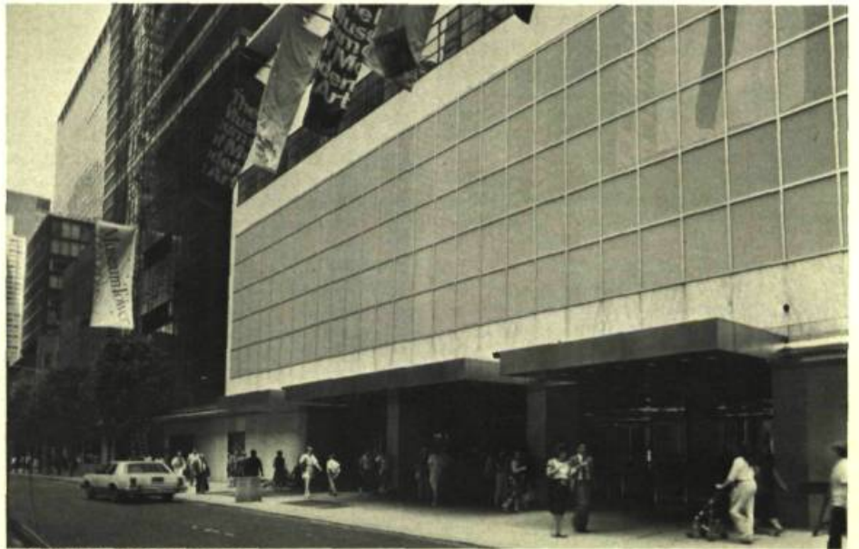
1. MUSEUM OF MODERN ART Front Entrance.