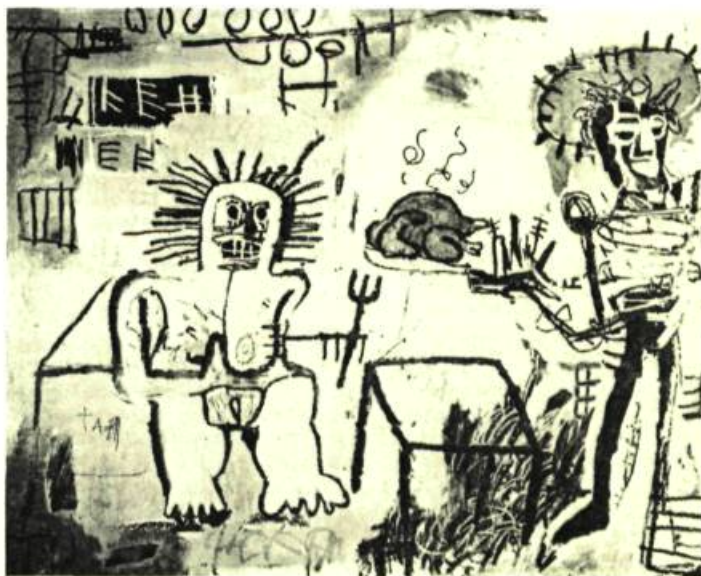
3. Jean-Michel BASQUIAT Rice and Chicken, 1982. Acrylic and oil on canvas. 172 cm x 213.5.

for the regional representations of Texas and to a lesser extent California. But strolling hardly describes the often pressurized sense of elbow to elbow, slow-motion movement of the mid-day and evening crowds. This was as much a public event, a matter of civic pride, as it was a place for dealers and collectors of all tastes to gather and talk shop.