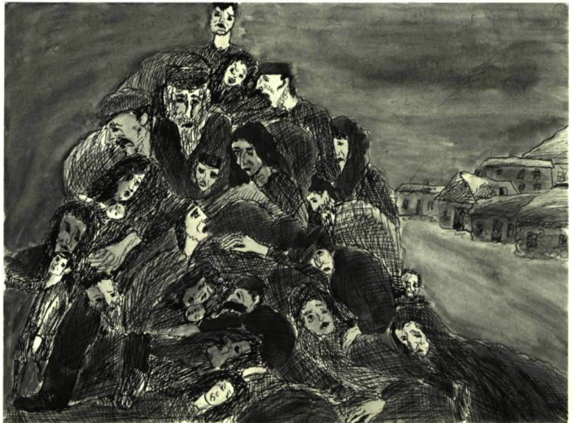
3. Yzhor , 1952. Aquarelle et encre; 30 cm 5 x 40,6.