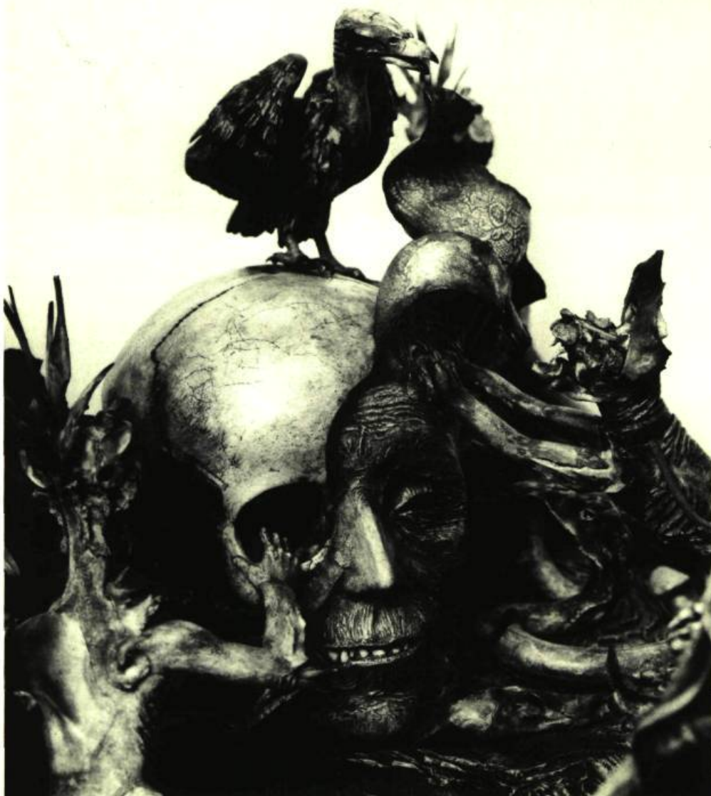
5. Les Champs magnétiques, 1974. Coffret-objet (détail).