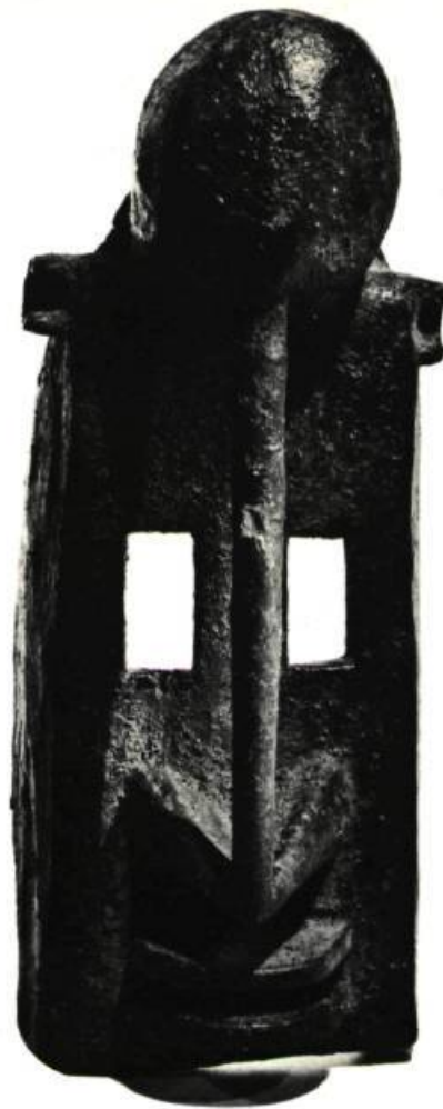
Page ci-contre: art du Congo. Masque, KUBA.