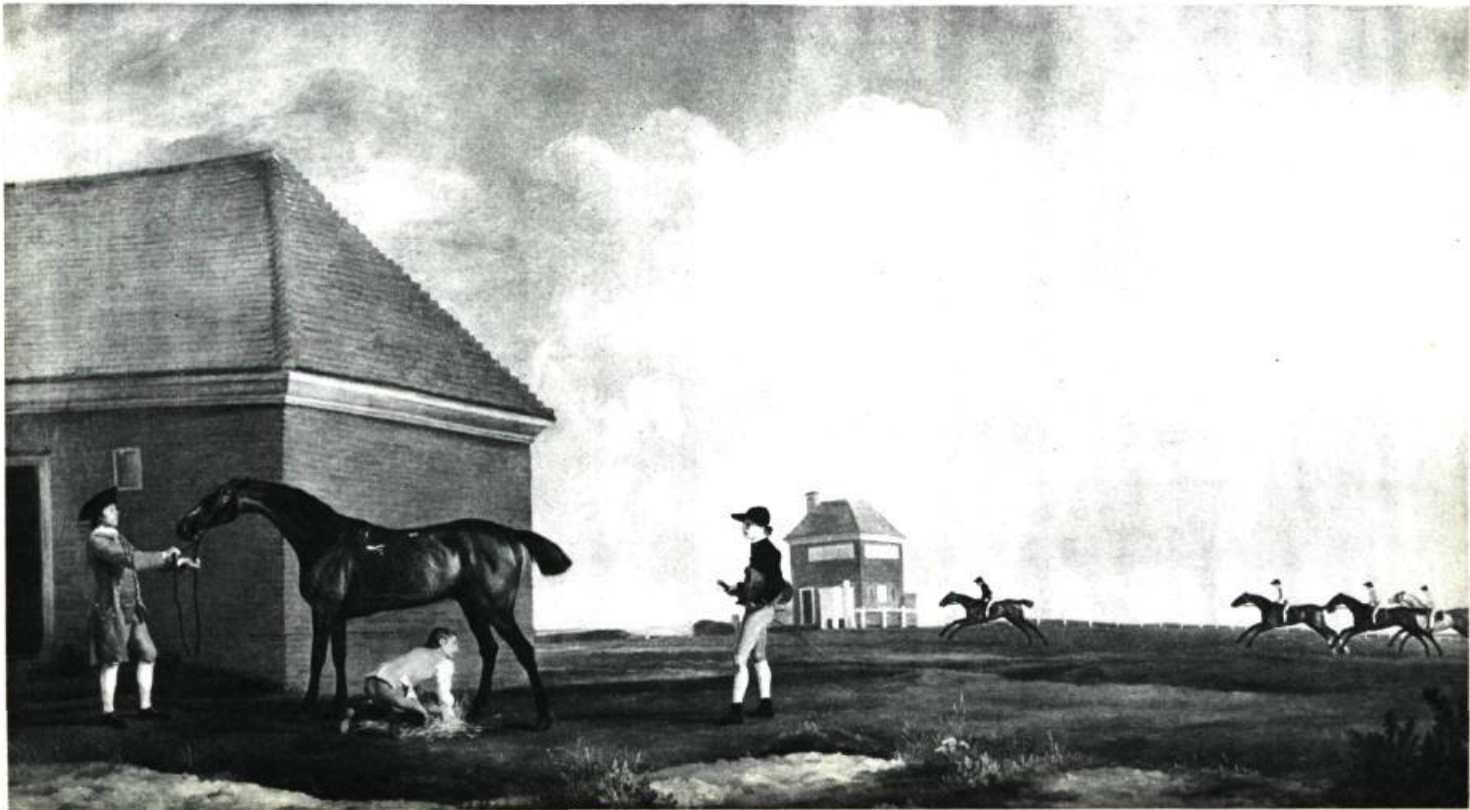
George Stubbs GIMCRACK WITH A GROOM, JOCKEY AND STABLE LAD ON NEWMARKET HEATH, 1765 huile H. 40" L. 76"