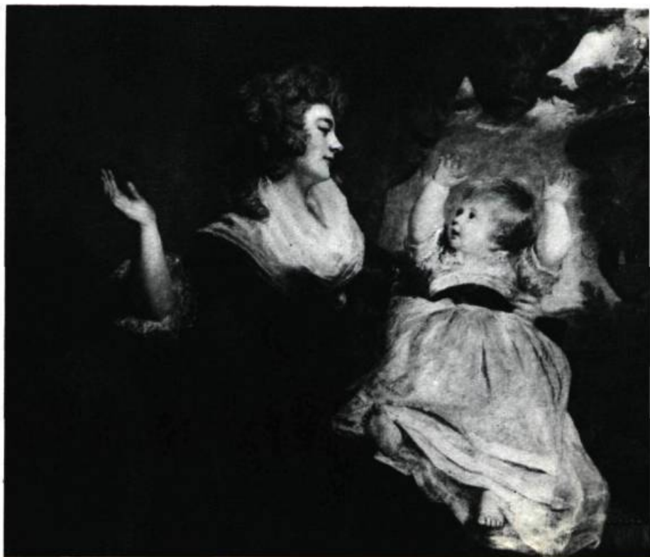
Sir Joshua Reynolds GEORGIANA, DUCHESS OF DEVONSHIRE AND HER DAUGHTER. 1784 huile H. 43½" L. 55¾" Collection des "Trustees of the Chatsworth Settlement".