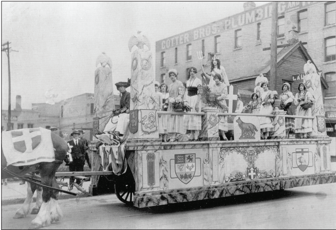
Holy Rosary Church Archives, Winnipeg