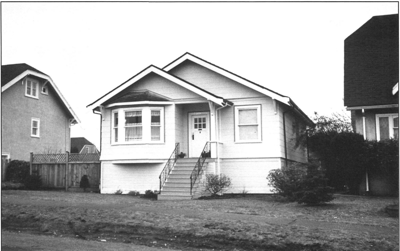
Figure 3: A City of Vancouver police officer originally lived in this $2,600, one-storey home, erected in 1920 on Triumph Street in East Vancouver under the Better Housing Scheme. The officer paid off his mortgage in 1937.

Still, if it did not benefit low-income households, the scheme did favour workers’ families. About 60% of Better Housing Scheme dwellings went up on the amalgamated city’s working-class east side, and about 40% were on the middle-class west side. 44 (See Figure 4.) The allotment committees gave the housing to applicants with up to $3,000 yearly income. Blue- and white-collar workers with the financial ability to repay their loans made up almost 80% of mortgagors between 1919 and 1929. 45 About 20% of the rest were