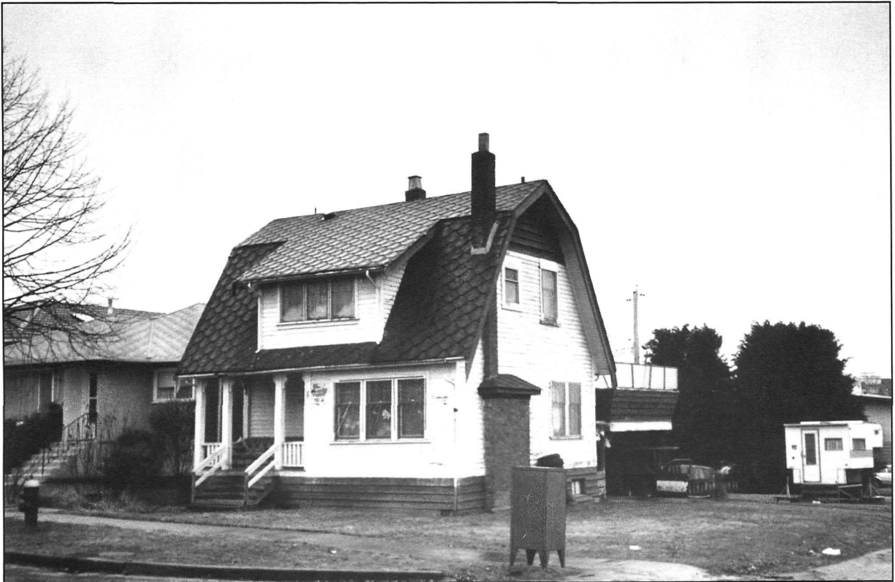
Figure 1: In 1919, the British Columbia Department of Lands built this soldier's home on Windsor Street in South Vancouver.