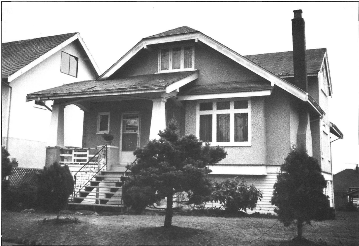
Figure 2: A bakery employee, a plasterer, and a carpenter successively owned this Better Housing Scheme bungalow built in 1920 for about $3,500 on West 13th Avenue in Kitsilano. The carpenter still owed $660 on the home in 1942.

The operation of Vancouver's Better Housing Scheme reinforces to some extent this bleak perspective of the national program. First, since the housing consisted of detached dwellings on scattered city lots, the scheme never represented an innovative model housing or planning project to Vancouverites as Adams and the federal cabinet committee had intended. Despite the city's control over the building process, the houses conformed to Vancouver's unplanned suburban development patterns and to its predilection for the bungalow styles offered by individual local builders. (See Figures 2 and 3.) Even the province's supervising architect, Henry