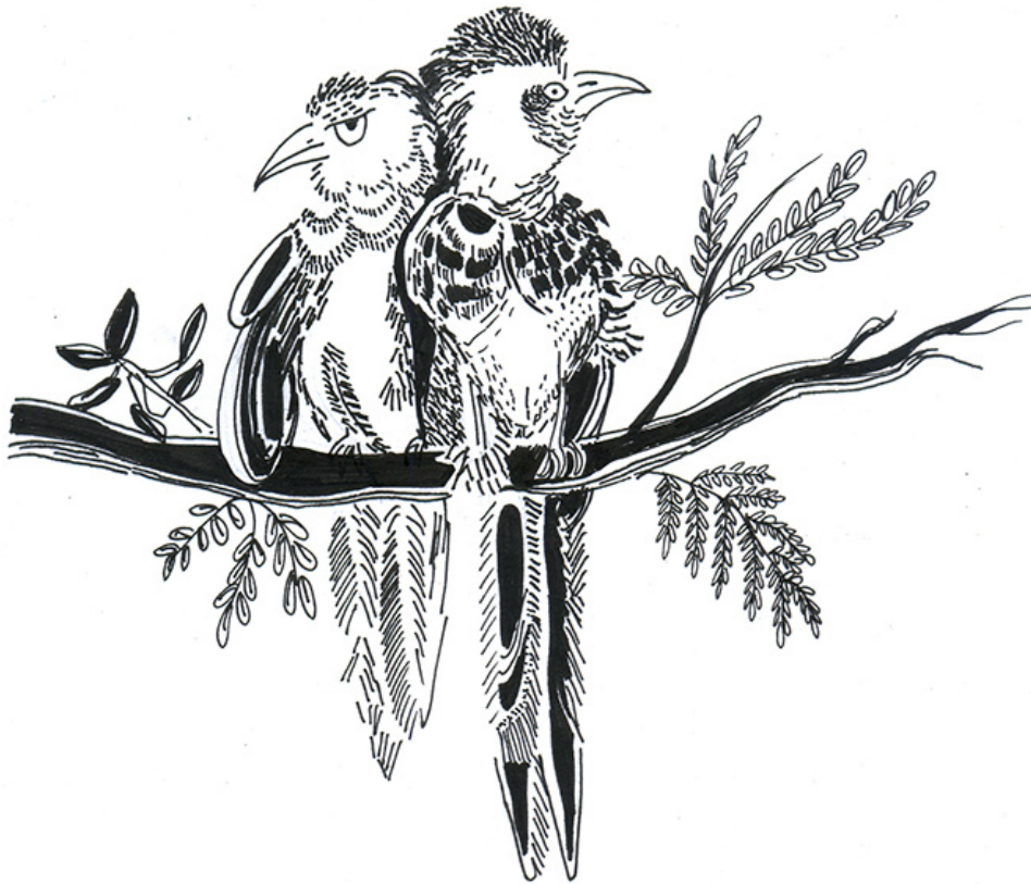
Image: Stylized rendering capturing the quirky attitudes of two babblers, Srivi Kalyan, Two Babblers , 2014, pen and ink.

extends the tripartite reality into a creative space where transformations into oneness can happen (Subash Kak, personal email communication, January 31, 2017). The part and the whole, the microcosm and macrocosm, the finite and the infinite, the one and the many are entwined, interwoven, diffused, in a flow of exchange, paradoxically both existent and non-existent. Great emotion suffuses the being, devoid of all character of joy or sorrow, and yet it rises at the confluence of both. The transcendent emotion and aesthetic emotion coalesce into deep experiencing of multiple levels of interconnectedness.