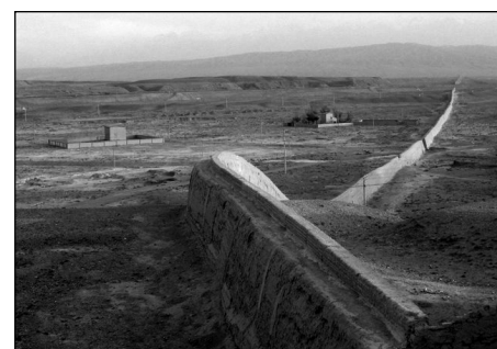
Jiayuguan Great Wall.

year-round source of water) and it has the province's highest transportation connectivity measures. Meanwhile, the Dunhuang region is in the middle of the desert and cannot support mass tourism. Tourism planning for the Dunhuang region needs to be segmented and focus on the luxury market only (it must also short-circuit the leakage problem involving foreign multinationals that repatriate their profits). Existing tourism resources in the Dunhuang region (e.g., the Mogao Caves UNESCO World Heritage Site) are already developing unsustainably due to the underlying water deprivation of the area. That is an important point and it warrants stressing that ecologically fragile areas cannot be targeted by tourism funding except in an extremely sensitive manner. Even ecotourism can have profound ecological implications. With the funnelled dollars arriving from luxury tourism recirculating in the local area, it may be possible to conserve heritage resources in a sustainable manner.