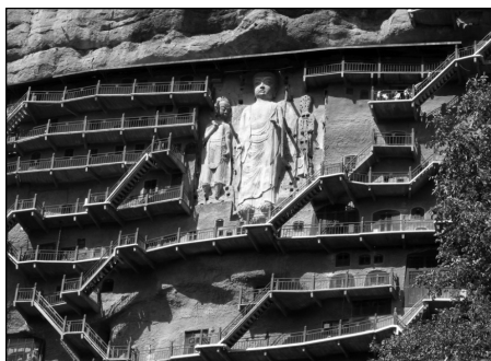
Maijishan Scenic Area.