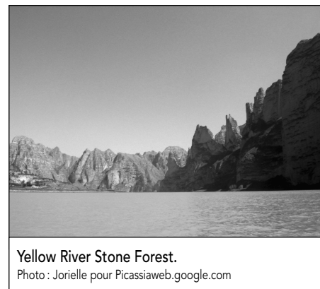
Yellow River Stone Forest.

The third stage of the research process involves a presentation of the overall evaluation results combined with a weighting. In the previous research stage, the results were generated whereby each theme value had equal weight. In the third stage, the themes are weighted according to their ability or capacity to change (although the government or another client may prefer a different rationale). In this ranking exercise, the weighting scheme employed reflects the following rationale: the marketability, economic spillo-