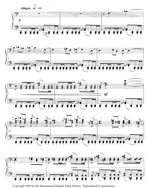
Example 6: Eduard Tubin, Piano Sonata No. 2, mov. 3, mm. 1-16

main theme, seen in Example 6, is essentially a decorated triadic figure in which interval-class 5 features prominently; by contrast, the subordinate theme emphasizes interval-class 1.