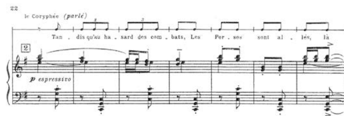
Example 3 Maurice Emmanuel, Salamine (1929), Act I, sc. 1 (VS 22).

rhythmiques, un disciple des grands classiques allemands (Emmanuel 1984c, 554).