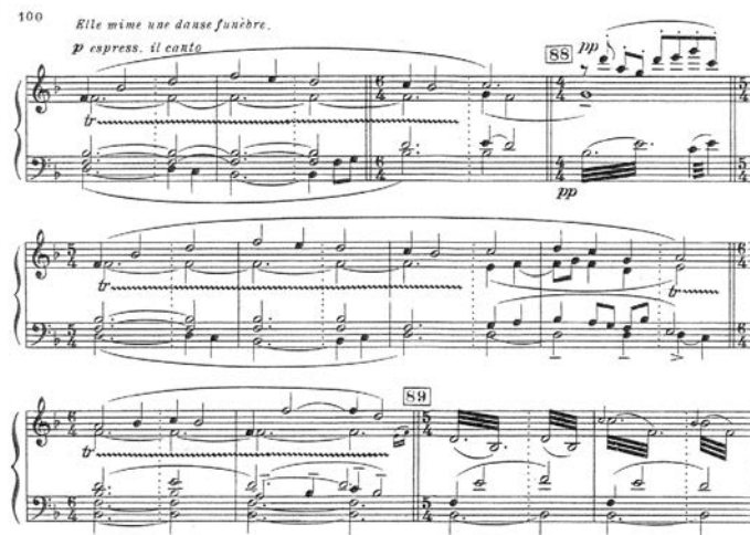
Example 4 Maurice Emmanuel, Salamine (1929), Act II, sc. 1 (VS 100).

expression seen in the placement of one hand on the head and the other directed toward the dead body. In Emmanuel's Figure 543 one can see the earlier depictions of the ritual, which were later replaced by the stylized gesture in Figures 551 and 553 (See Figs. 1a and 1b). Emmanuel described these latter poses as "prototypical" funeral gestures, and stated that although the ritual of tearing the hair had been lost, the gesture had been retained; moreover, Emmanuel described the dance for these funeral rites as "full of calm" versus the violence of the threnodic hair pulling. 10