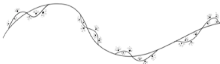
Fig.1 Curvy A.1, a Bézier curve is figuring the highest loceme, itself mapping other quasi-self-similar locemes. The lowest level locemes are black dots, which in three dimensions could figure a stylised rock, just

The fundamental symbol of Curvy A is a stylised river shape, curved, hence the name, which is essentially a Bézier curve (fig. 1). As it turns out, a more complex, asymmetric and packaged curve (that is, with more meanders) is intuitively more memorable, and allows for the mapping of more content in a single view (fig. 2). This river shape is a strand of loci (fig. 3), each being another strand for other loci (fig. 4) which are groups of noems of various shapes so as to facilitate their memorisation. The purpose of Curvy A is to capture some of the aspects of the interaction between long term and short term memory in the method of loci, and to make it writable in a procedural manner. Hence, being an externalisation of the method of loci, it is a media, albeit fundamentally different from writing. Among other things, it is a procedural writing.