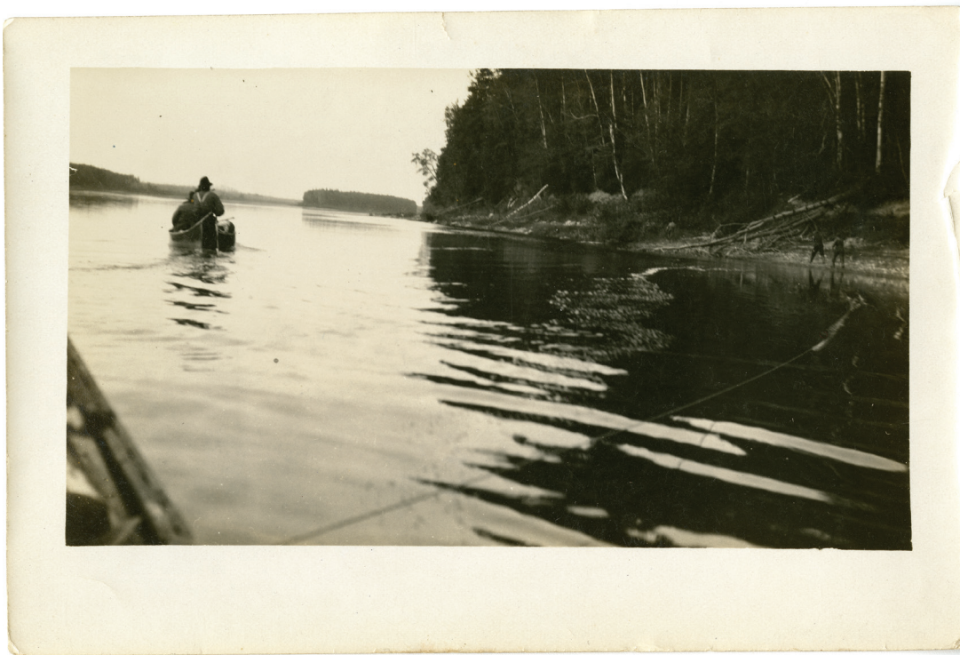
Using leadlines from shore to canoe. Bowes Collection. Courtesy of the Maritime Museum of the Atlantic, Halifax, Nova Scotia, a part of the Nova Scotia Museum, MP313.1.16