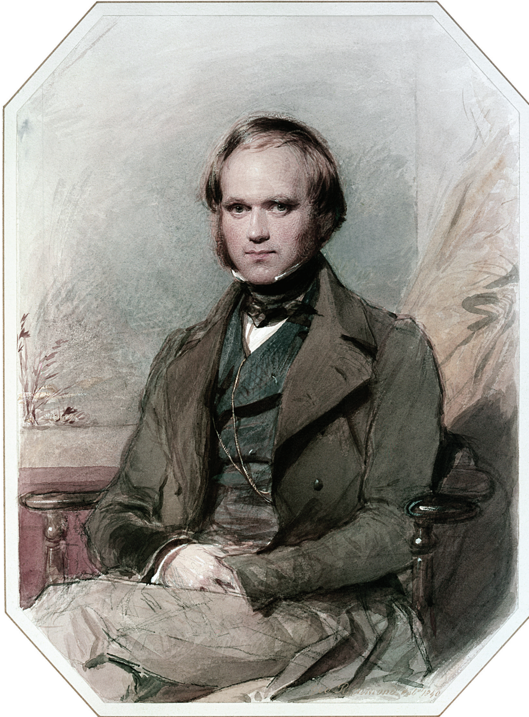
Figure 1. Water-colour portrait of Charles Darwin, after his return from the voyage of the Beagle, by George Richmond, 1830s.