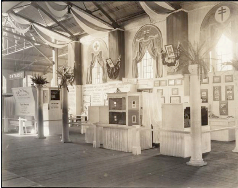
Figure 10. "General View of Health Exhibit at Canadian National Exhibition," 1918.