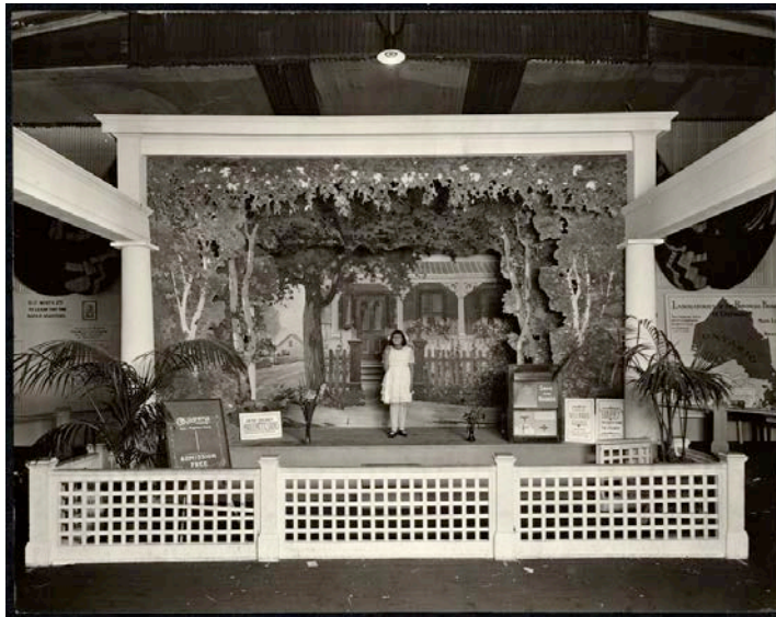
Figure 4. "Stage," 1921.