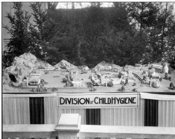
Figure 5. "Division of Child Hygiene Exhibit – Canadian National Exhibition," 1926.