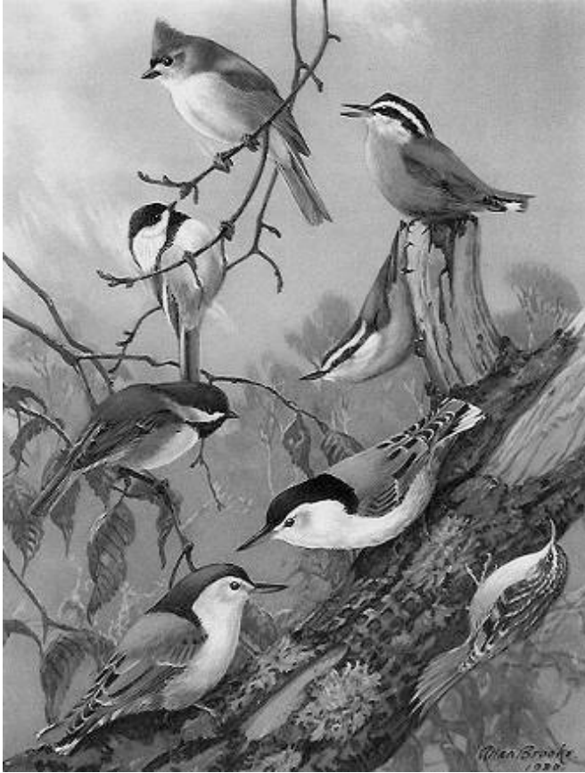
Figure 5. Plate 56 showing Nuthatches, creepers and titmice demonstrating the problem Brooks frequently faced of designing a meaningful composition for a plate with so many birds.

Source: T.S. Roberts, The Birds of Minnesota (1932).