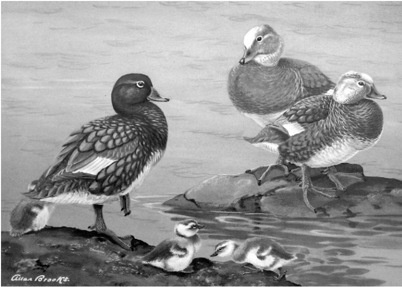
Figure 3. The Steamer Duck with downy young done for Phillips' The Natural History of the Ducks shows Brooks' great affinity for and skill with waterfowl.

Source: The Natural History of the Ducks (1922-6) vol. 3, plate 65. Courtesy of the Royal Ontario Museum Library and Archives.