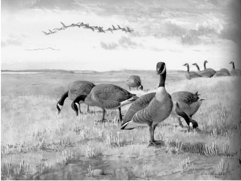
Figure 6. A Painting of Canada Geese (1936) in a prairie landscape, one of a series of 12 landscape paintings with birds commissioned by the Howard Smith Paper Mills Ltd. for a calendar.