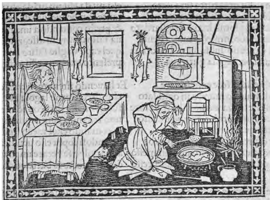
Figure 3. Carnival, Contrasto di Carnesciale e della Quaresima (Florence: Lorenzo Morgiani and Johann Petri, ca. 1492–95), 4°, woodcut. ©British Library Board, IA.27918, sig. a1r (detail).

1494 in Florence and reprinted several times in sixteenth-century Venice. 38 Here one finds Carnival in the guise of a glutton eating and drinking at a table, while an attendant is roasting chicken in a kitchen filled with plucked poultry hanging from the walls (fig. 3). The fact that Leandro also illustrated a kitchen abundant with poultry and a figure drinking wine in February demonstrates the affinity of the canvas with this popular carnivalesque imagery (fig. 1).