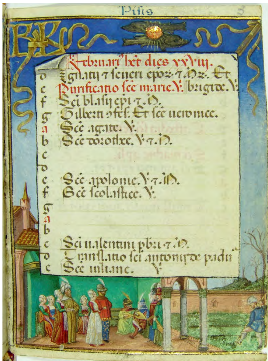
Figure 5. February , Cristoforo de Predis, Borromeo Book of Hours , Milan, ca. 1471. ©Veneranda Biblioteca Ambrosiana, MS S.P.42, fol. 3r.