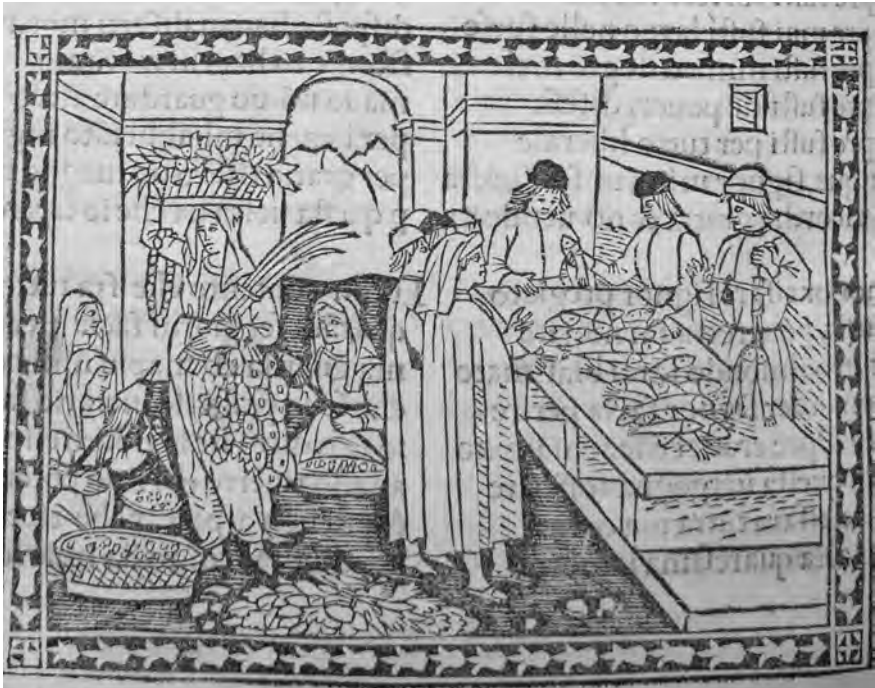
Figure 4. Lent, Contrasto di Carnesciale e della Quaresima (Florence: Lorenzo Morgiani and Johann Petri, ca. 1492–95), 4°, woodcut. IA.27918, sig. a8v (detail).

The luxurious foods of February are replaced by the mundane onions and garlic of March, when austerity takes the place of Carnival's wantonness and pleasures. Returning to the Florentine Contrasto , one finds the same correspondence between the month of March in Leandro and the woodcut representing Lent (fig. 4). Both images depict on the right the fish market; on the left, women selling products associated with Lenten restraint and fasting (fig. 2). 39 Already by the fourteenth century, Antonio Pucci evoked this shift in the foodstuff of