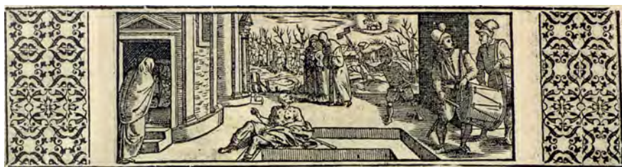
Figure 11. March, Missale Romanum, ex decreto sacrosancti Concilij Tridentini restitutum (Venice: Lucantonio II Giunta, 1576), f o , woodcut. ©Biblioteca Nazionale Centrale di Roma, 12. 9.H.1, sig. +5r (detail).

The 1576 Missal exhibits the same dialogic relationship between the imagery of February and March as that encountered in Leandro's cycle. The woodcut of February, first considered in this article, depicts an early and unique visual document of the comic group of the master Pantalone and his servant Zanni performing at a courtly banquet (fig. 10). 84 The characteristic mask and pose of the greedy Pantalone, who leans forward with one hand behind and one in front, recalls the gesture of the analogous figure in Leandro's canvas. His servant Zanni wears the typical clothes of the Bergamasque peasant porter, with loose, ankle-length trousers and a long-sleeved jacket of light-coloured linen. 85