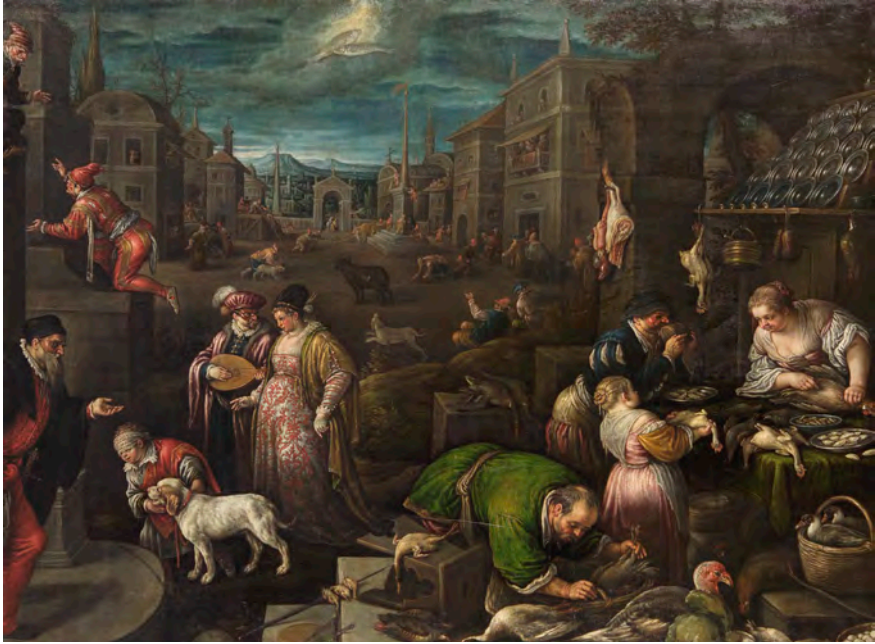
Figure 1. February , Leandro Bassano, The Twelve Months , before 1595, oil on canvas, canvas size 144.5 × 190 cm. © KHM-Museumsverband, Inv. Gemäldegalerie, 4293.

in Vienna and the Prague Castel Picture Gallery. 6 Based on the accounts of Carlo Ridolfi, scholars have identified Leandro's Months with the cycle sent by Jacopo Bassano to Emperor Rudolf II (1552–1612). 7 The two preserved series are in accordance with the encyclopedic style of the Bassano brothers, manifested through the borrowing of elements from different sources, from prints to previous repertoires of the workshop, and elements from Flemish artists, displayed in densely populated landscapes.