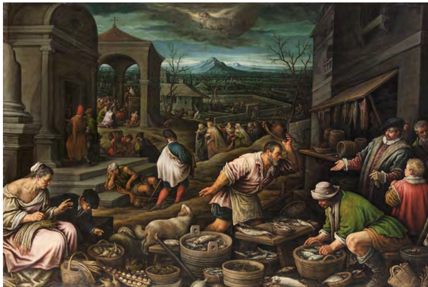
Figure 2. March , Leandro Bassano, The Twelve Months , before 1595, oil on canvas, canvas size 145.5 × 216 cm. © KHM-Museumsverband, Inv Gemäldegalerie, 4296.

This study focuses on Leandro's paintings of February and March (Kunsthistorisches Museum, Gemäldegalerie, Inv. 4293 and 4296) since the respective canvases from Francesco's set were destroyed in 1915. 8 It also introduces an intact set of small-size replicas produced most probably in Leandro's workshop, originating from the estate of the Count of Bobrinsky, in Bogoroditsk, now in the Regional Museum of Fine Arts in Tula. 9