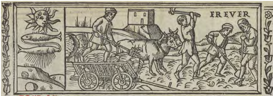
Figure 7. February , in Missale Romanum (Venice: Bernardino Stagnino, 3 July 1509), 4°, woodcut. Reproduced by kind permission of the Syndics of Cambridge University Library, F150.c.2.11, sig. *2v (detail).

An analysis of the missals printed before 1570 has identified five prototypes, all following the pattern that shows in February the spreading of manure and the resumption of the work in the field, and in March, the pruning of the vine (figs. 7–8). 64 Figure 6 classifies the Venetian Missalia Romana into three main categories. The blue-coloured bars represent the editions which include calendars not illustrated. The iconographic pattern showing the fertilization of the soil in February and the pruning in March is represented by green bars. The red bars chart calendars presenting an iconography still to be discussed. 65