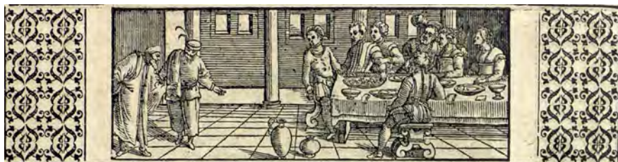
Figure 10. February, Missale Romanum, ex decreto sacrosancti Concilij Tridentini restitutum (Venice: Lucantonio II Giunta, 1576), f o , woodcut. ©Biblioteca Nazionale Centrale di Roma, 12. 9.H.1, sig. +4v (detail).