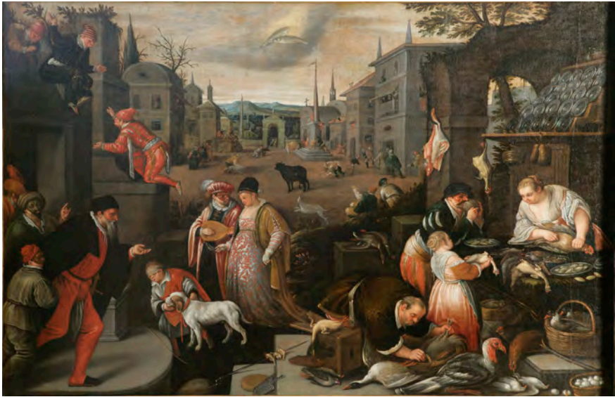
Figure 12. February, Leandro Bassano or his workshop, The Twelve Months, end of the sixteenth to the beginning of the seventeenth century, 80 x 121 cm.

the Bassano workshop. 94 Paintings of the commedia dell'arte were possibly intended for a non-Venetian public. Both Ferdinando I de' Medici and Rudolf II, who acquired such cycles, enjoyed theatrical entertainments by professional companies. 95 It is more convincing, however, that Leandro sought to convey and develop a didactic message in line with that of the Missal.