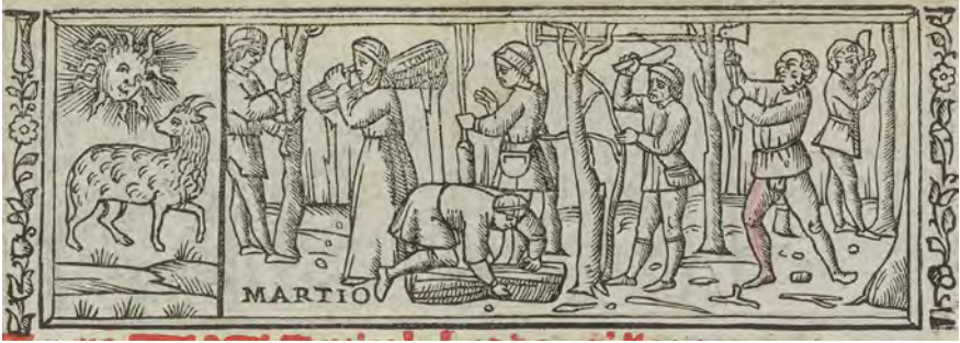
Figure 8. March , in Missale Romanum (Venice: Bernardino Stagnino, 3 July 1509), 4 o , detail of woodcut. Reproduced by kind permission of the Syndics of Cambridge University Library, F150.c.2.11, sig. *3r (detail).