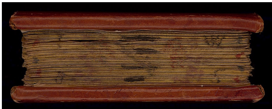
Figure 3. Gauffered fore-edge with coat-of-arms of the Duke of Saxony and the initials of Duke John William of Saxony (Research Library of Gotha, Memb. II 150).