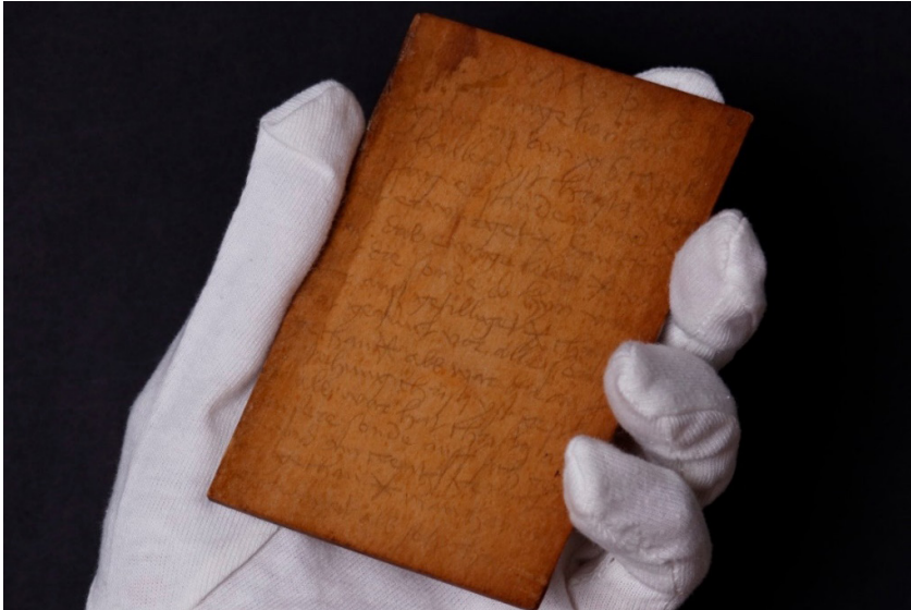
Figure 2. Palm-sized maple wood tablet for taking notes (Research Library of Gotha, Chart. B 1561, fol. 2r).

around the end of the sixteenth century. 60 Some who attended services brought wooden folding chairs along with them. If one could sit, it was possible to take notes in a bound volume of blank leaves of paper resting on one's lap. An object with a hard surface could also be placed on one's lap in order to write on individual leaves. 61 This was indeed the manner in which Crusius recorded sermons in the church, as he frequently mentioned. 62