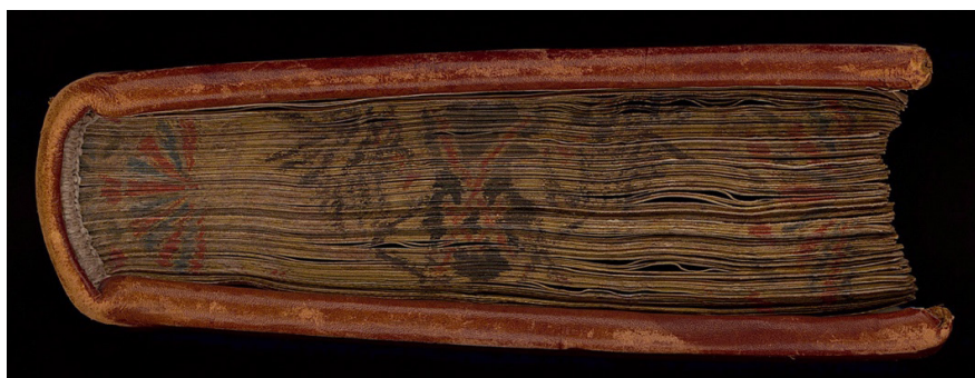
Figure 4. Gauffered top edge with coat-of-arms of the electors of Saxony (Research Library of Gotha, Memb. II 150).

Elector John's wooden tablets were not enhanced outwardly, but this could simply be due to their material form. Whereas binding techniques for parchment and paper volumes had been continually developed and refined over centuries, no tradition of opulently decorating such thin wood tablets existed. The bindings for the tablets in Gotha and Coburg are so similar that they were most likely made at the same workshop during the sixteenth century. 79 Two