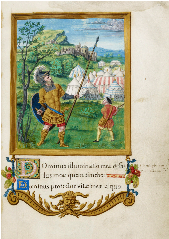
Figure 1. Henry VIII as David fighting Goliath, Psalm 26 in Henry VIII's Psalter.