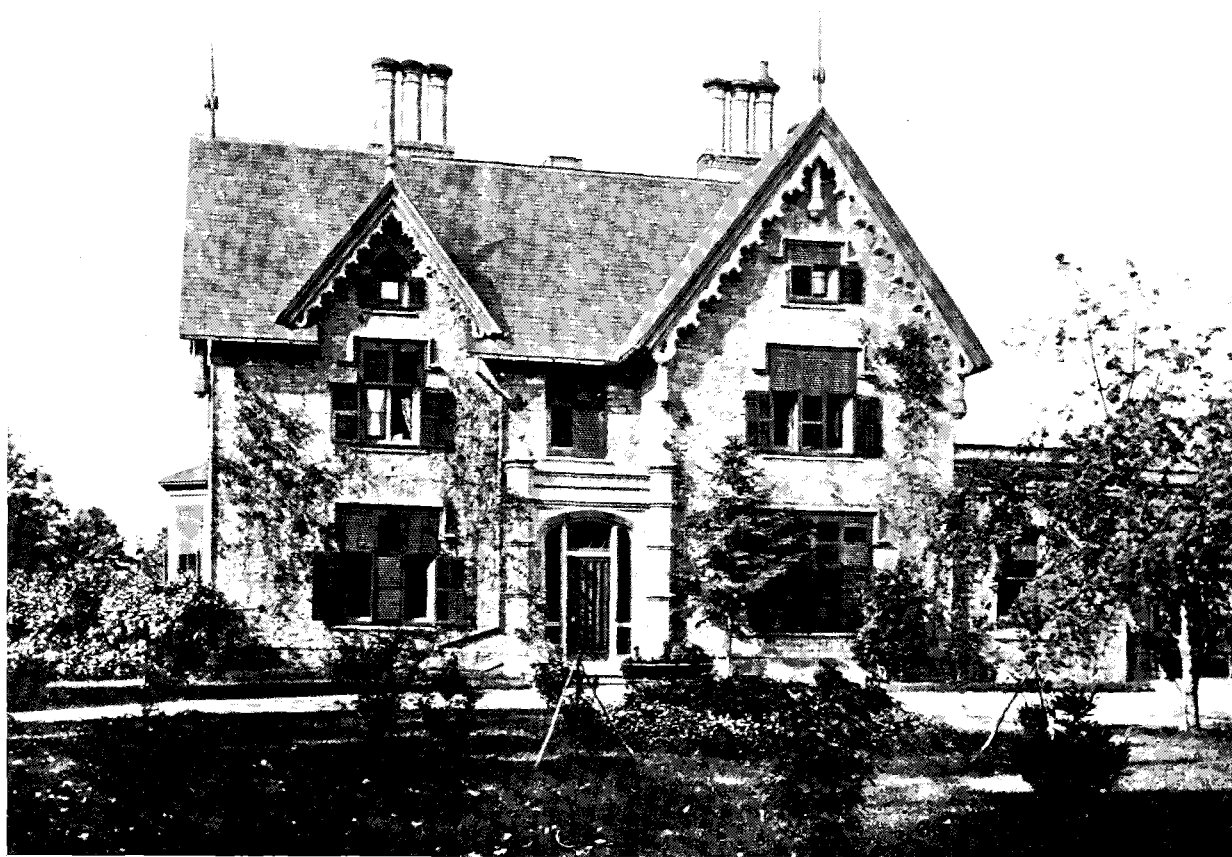
EARNSLIFFE Sir John Macdonald's residence at Ottawa