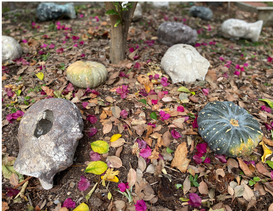
Fig. 7. Nina Sanadze, Terminus , 2021. Still from short experimental film, 34 mins.

Now, in isolation with my family during the times of pandemic, I found myself again surrounded by the artefacts of Topuridze's practice in a domestic setting, on the other side of the world. It is an eerie evocation of my childhood experience which I have tried to capture and contextualise in my experimental short films Terminus | fig. 7 | and Embedded . | fig. 8 |