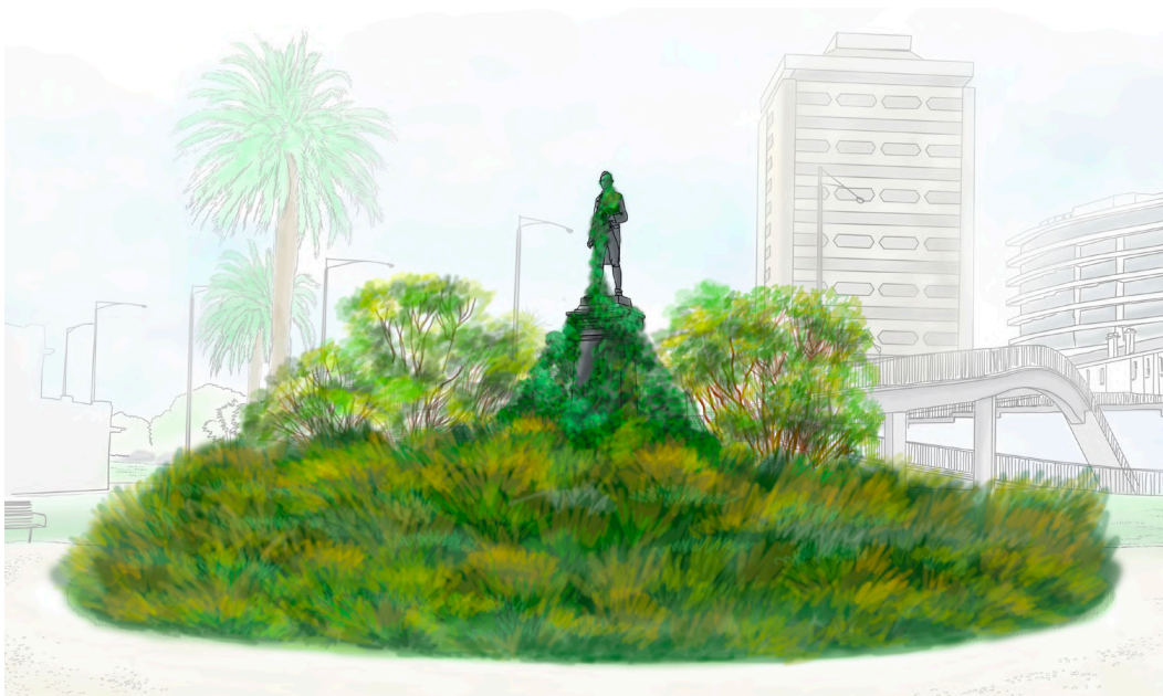
Fig. 11. Nina Sanadze, Grass Monument , drawing for the proposed project, Captain Cook monument, St Kilda foreshore, Melbourne, Australia, 2020.

Presenting appropriated original artefacts, replicas, or documentary films as witnesses and evidence, I seek to re-examine our grand political narratives from a personal position. Having no answers, but many questions, I see my work as a series of provocations, practice or rehearsals with speculations. ¶