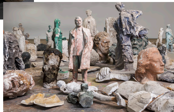
Figure 6. Nina Sanadze, Apotheosis , ACE Open, Adelaide, Australia, 2021. Studio archive of Soviet sculptor Valentin Topuridze (1907–1980), plaster models, moulds and fragments, dimensions variable.

Having acquired and transported Topuridze's archive from Georgia to Australia, through various installation incarnations like Monumental Shift in Melbourne | fig. 5 | and Apotheosis in Adelaide, | fig. 6 | I have used it to develop a material language that addresses personal and political memory.