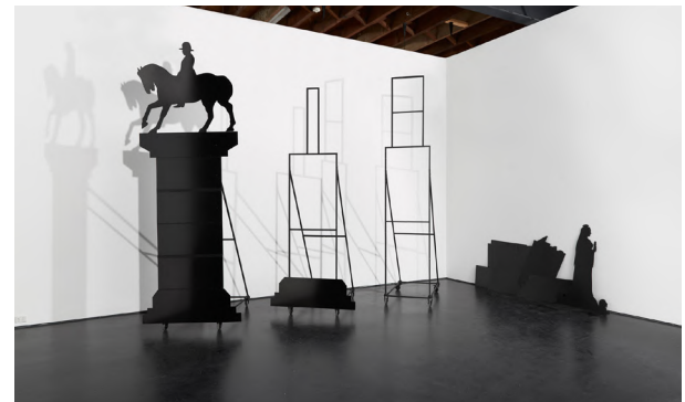
Fig. 10. Nina Sanadze, Monuments and Movements , Margaret Laurence Gallery, Melbourne, Australia, 2019. Steel, epoxy enamel paint, aluminium composite panels, castor wheels, dimensions variable.