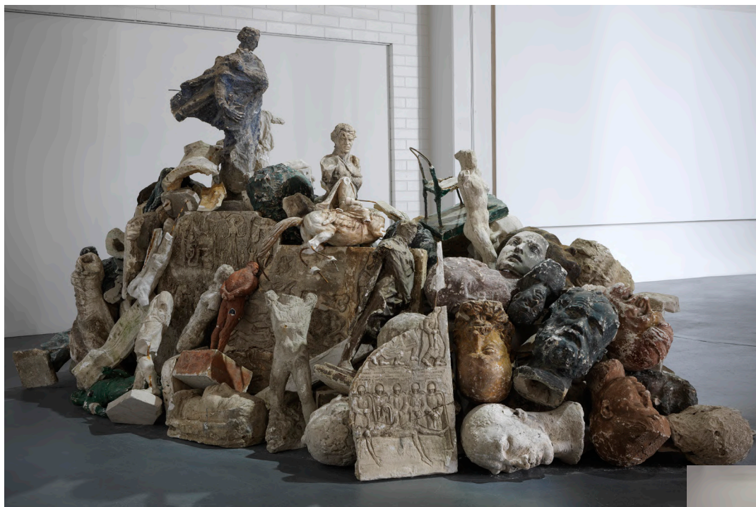
Figure 5. Nina Sanadze, Monumental Shift , Victorian College of the Arts, Melbourne, Australia, 2019. Studio archive of Soviet sculptor Valentin Topuridze (1907–1980), plaster models, moulds and fragments, 4m 2 .

Having acquired and transported Topuridze's archive from Georgia to Australia, through various installation incarnations like Monumental Shift in Melbourne | fig. 5 | and Apotheosis in Adelaide, | fig. 6 | I have used it to develop a material language that addresses personal and political memory.