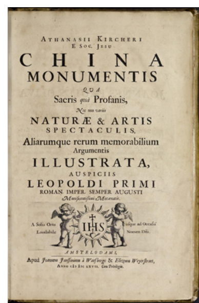
Figure 2. Athanasius Kircher, China Illustrata, 1667, title page.

Figure 1. Anonymous, The Kangxi Emperor, 1667. Engraving. From Athanasius Kircher, China Illustrata.