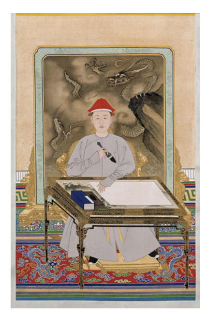
Figure 4. Anonymous Court Artist, Portrait of the Kangxi Emperor in Informal Dress Holding a Brush, Hanging Scroll, 1662–1722, Beijing, The Palace Museum.

12. For the Jesuits at the Mughal court see Gauvin Alexander Bailey, The Jesuits and the Grand Mogul: Renaissance Art at the Imperial Court of India, 1580–1630 (Washington, Dc: Smithsonian Institution, 1998); Gauvin Alexander Bailey, Art on the Jesuit Missions in Asia and Latin America, 1542–1773 (Toronto: University of Toronto Press, 1999), 112–143; and Mika Natif, Mughal Occidentalism: Artistic Encounters between Europe and Asia at the Courts of India, 1580–1630 (Boston and Leiden: Brill, 2018), esp. 48. For a more general overview