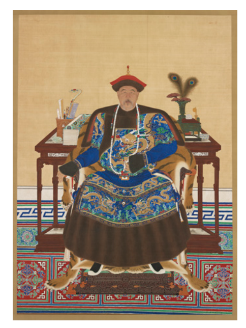
Figure 5. Anonymous artist, Unidentified Nobleman in Front of a Table, Hanging Scroll, Qing Dinasty, eighteenth to nineteenth century. Arthur M. Sackler Gallery, Smithsonian Institution, Washington, DC: Purchase. Smithsonian Collections Acquisition Program and partial gift of Richard G. Pritzlaff, S1991.126.

Figure 4. Anonymous Court Artist, Portrait of the Kangxi Emperor in Informal Dress Holding a Brush, Hanging Scroll, 1662–1722, Beijing, The Palace Museum.