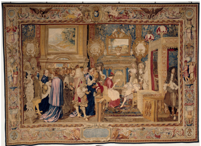
Figure 11. Workshop of Jean Lefebvre after Charles Le Brun, The Audience with Cardinal Chigi, 1665–1672. Wool, silk, and giltmetal-wrapped thread. Paris, Louvre.