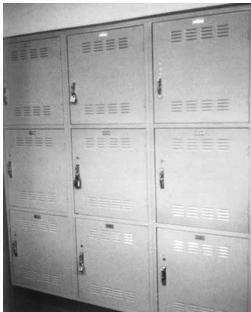
Figure 1. Chris Burden, Five Day Locker Piece, April 26–30, 1971. Performance/sculpture, University of California, Irvine. © 2017 Chris Burden; licensed by the Chris Burden Estate and Artists Rights Society (ARS), New York.