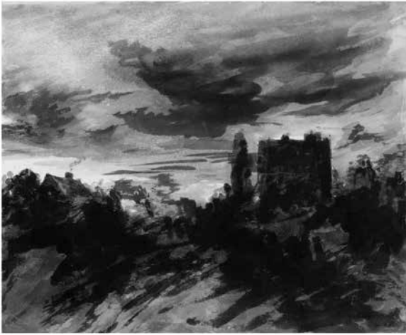
Figure 9. John Constable, A House, Cottage, and Trees by Moonlight , ca. 1830–36. Sepia and grey wash, 18.7 × 22.8 cm. London, Victoria and Albert Museum.

framework of thought had to be opaque. The truthfulness of Constable's naturalism was therefore signalled by the unbridgeable gap between the physiological process of sensation and mental perception. That sensuous feelings did not bear any resemblance to the objects causing them, moreover, left room for the artist's imagination, as Knight had already stressed. Thus, Constable could exploit the figurative impulse of the perceptual process revealed by Berkeley, Reid, Knight, and Alison in order to convey more than merely optical phenomena. He could impart the noisy, rambunctious atmosphere of East Bergholt Fair | fig. 8 | to the viewer, or imbue a landscape with his own feelings as in his late bistre drawings, | fig. 9 | thus giving pictorial expression to subjective experiences independent of external senses. From this perspective, Constable's late "expressionistic" oeuvre appears quite consistent with the naturalist aesthetics the artist developed in the first decades of his career. ¶