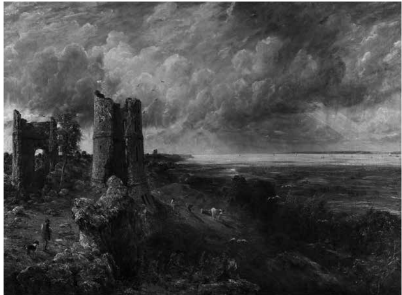
Figure 1. John Constable, Hadleigh Castle, The Mouth of the Thames – Morning after a Stormy Night , 1829. Oil on canvas, 121.9 x 164.5 cm. New Haven, Yale Center for British Art, Paul Mellon Collection.

especially when it comes to Constable's late work, stressing its complexity and conflicting aspects, 373. For a subtle reading of Constable's late landscape painting as autobiographical project within a broader study of the impact of economic and social changes on the perception of the English countryside during the long eighteenth century, see Ann Bermingham, Landscape and Ideology: The English Rustic Tradition, 1740–1860 (Berkeley/Los Angeles, 1986), 87–155, esp. 128–29.