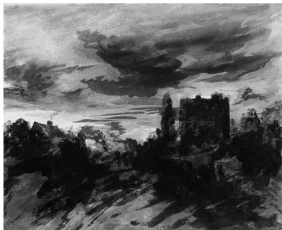
Figure 9. John Constable, A House, Cottage, and Trees by Moonlight , ca. 1830–36. Sepia and grey wash, 18.7 × 22.8 cm. London, Victoria and Albert Museum.

framework of thought had to be opaque. The truthfulness of Constable's naturalism was therefore signalled by the unbridgeable gap between the physiological process of sensation and mental perception. That sensuous feelings did not bear any resemblance to the objects causing them, moreover, left room for the artist's imagination, as Knight had already stressed. Thus, Constable could exploit the figurative impulse of the perceptual process revealed by Berkeley, Reid, Knight, and Alison in order to convey more than merely optical phenomena. He could impart the noisy, rambunctious atmosphere of East Bergholt Fair | fig. 8 | to the viewer, or imbue a landscape with his own feelings as in his late bistre drawings, | fig. 9 | thus giving pictorial expression to subjective experiences independent of external senses. From this perspective, Constable's late "expressionistic" oeuvre appears quite consistent with the naturalist aesthetics the artist developed in the first decades of his career. ¶