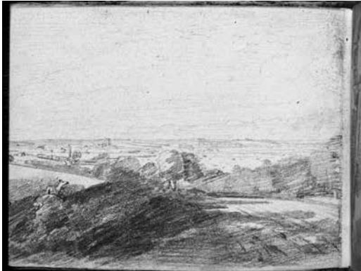
Figure 5 (right). John Constable, after Salvator Rosa, Vision of Jacob , 1811. Graphite on paper, 9.0 x 15.2 cm. Private collection.

Figure 4 (left). John Constable, Dedham Vale , 1814. Graphite on paper, 7.9 x 10.8 cm. London, Victoria and Albert Museum.