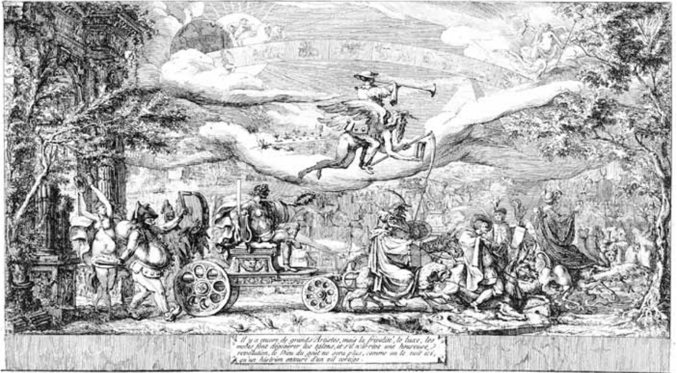
Figure 2. Anonymous, Triomphe des Arts Modernes , ca. 1760. Etching and engraving, 36.2 x 21.7 cm. BnF, Paris.