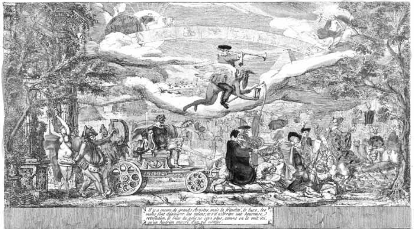
Figure 3. Anonymous, Triomphe des Arts Modernes , ca. 1791. Hand-coloured etching and engraving, 37 x 22.5 cm. BnF, Paris.