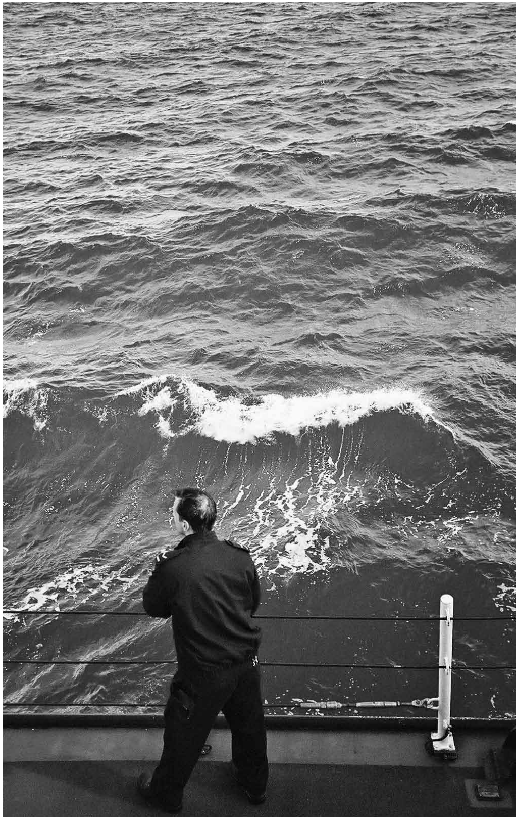
Ho Tam, Untitled (waves) , 2006. C-print.